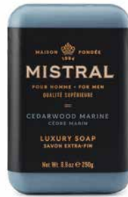
CEDARWOOD MARINE: MS8CM