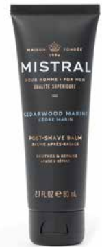
CEDARWOOD MARINE: MMPS80CM