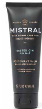
SALTED GIN: MMPS80SG