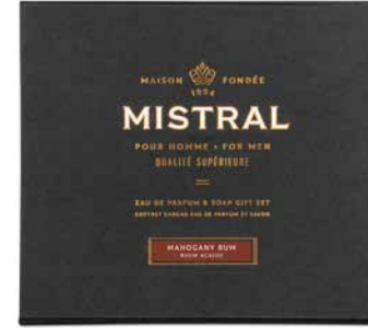
MAHOGANY RUM: MMPGSMR