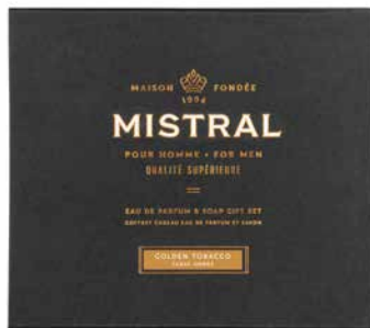
GOLDEN TOBACCO: MMPGSGT