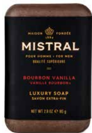
TRAVEL SIZE BAR SOAP BOURBON VANILLA: 2.8 OZ • 80 G MS2BV