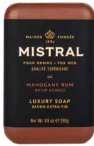
MAHOGANY RUM: MS8MR