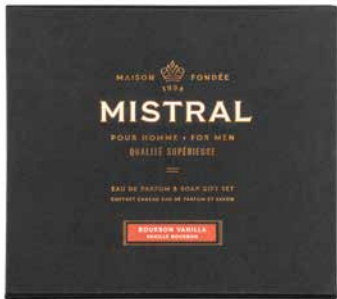
BOURBON VANILLA: MMPGSBV