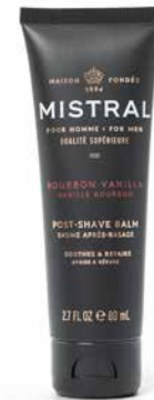
BOURBON VANILLA: MMPS80BV