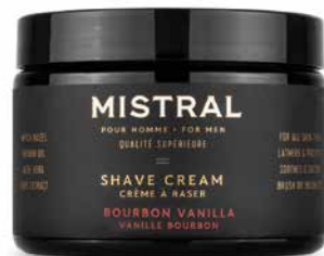
BOURBON VANILLA: MMSHTBV