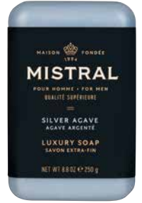
SILVER AGAVE: MS8SI