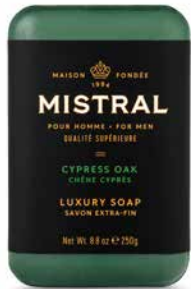
CYPRESS OAK: MS8CO