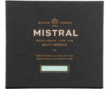
SALTED GIN: MMPGSSG