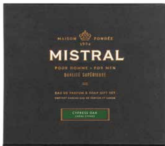
CYPRESS OAK: MMPGSCO