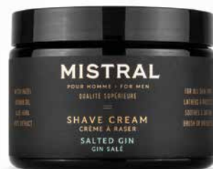
SALTED GIN: MMSHTSG