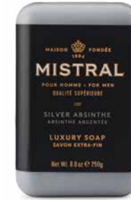
SILVER ABSINTHE: MS8SA