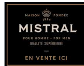
SIGNAGE: MSDS Printed and laminated on aluminum composite, grommets in 4 corners 14" WIDE X 11" HIGH