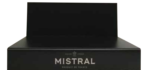
SOAP DISPLAY: MMSD4 Displays 16 men's bars 10.5" WIDE X 7" DEEP X 3.75" HIGH