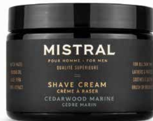
CEDARWOOD MARINE: MMSHTCM