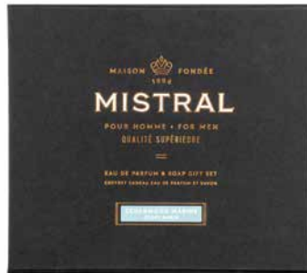
CEDARWOOD MARINE: MMPGSCM