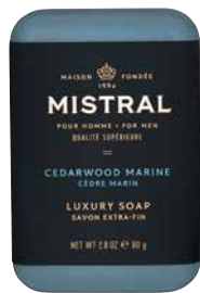
TRAVEL SIZE BAR SOAP CEDARWOOD MARINE: 2.8 OZ • 80 G MS2CM