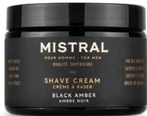
BLACK AMBER: MMSHTBA