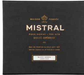
BLACK AMBER: MMPGSBA

ONE 3.3 FL. OZ. EAU DE PARFUM AND MATCHING 8.8 OZ. BAR SOAP BEAUTIFULLY PACKAGED FOR ANY OCCASION.