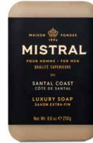
SANTAL COAST: MS8SC