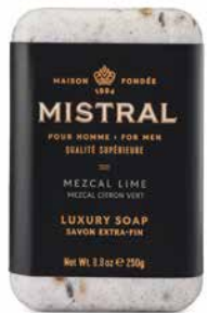
MEZCAL LIME: MS8MZ *EXFOLIATING