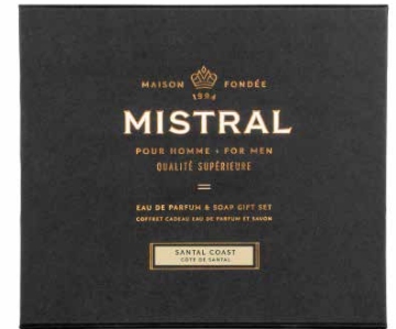
SANTAL COAST: MMPGSSC