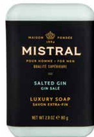
TRAVEL SIZE BAR SOAP SALTED GIN: 2.8 OZ • 80 G MS2SG