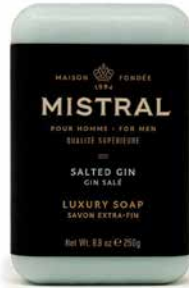
SALTED GIN: MS8SG