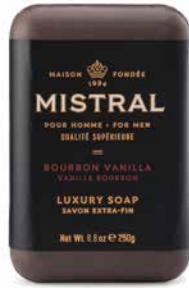
BOURBON VANILLA: MS8BV *EXFOLIATING