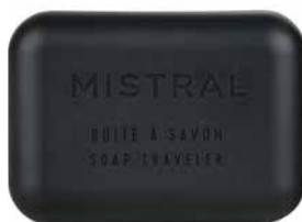
SILICONE SOAP CASE FOR 2.8 OZ BAR: MS2TC