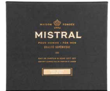
TEAK WOOD: MMPGSTK