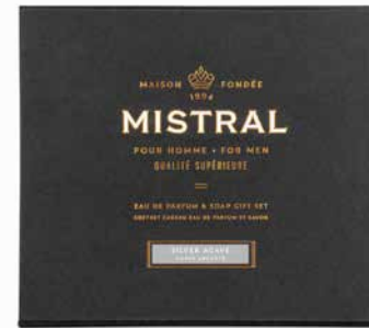
SILVER AGAVE: MMPGSSI