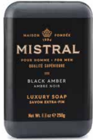
BLACK AMBER: MS8BA

BAR SOAPS ARE FREE FROM ALCOHOL, PARABENS, PHTHALATES, AND TALLOW