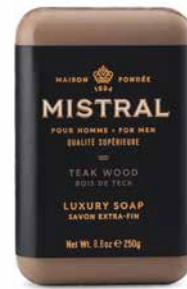
TEAK WOOD: MS8TK