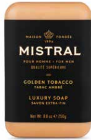
GOLDEN TOBACCO: MS8GT