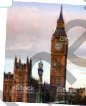
Big Ben, London