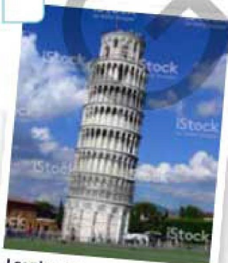
Leaning Tower of Pisa, Italy