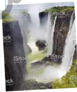
Victoria Falls, Zimbabwe