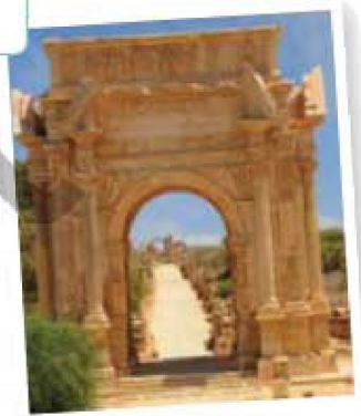
Leptis Magna, Libya