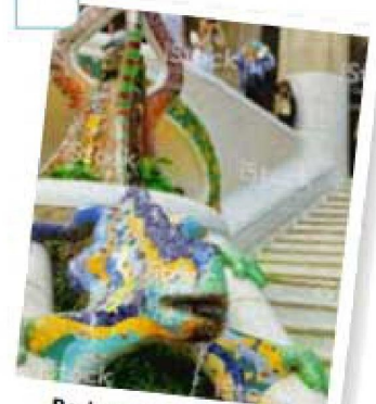
Park Guell, Barcelona