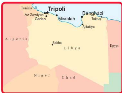
Map of Libya