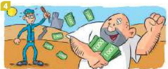
4 I tried being a policeman, but ...