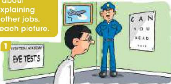
1 I wanted to be a pilot, but I failed the eye test.