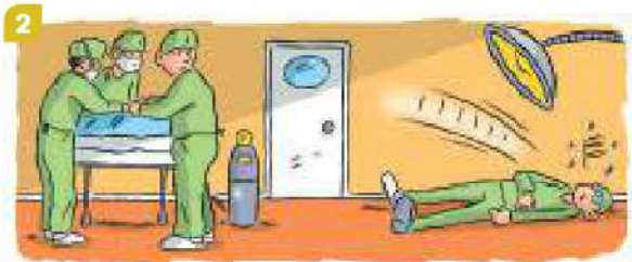
2 I started training to be a doctor, but ...

C21 SKILLS A Listen to a film director talking about finding the right career. He is explaining what happened when he tried other jobs. Complete the captions under each picture.