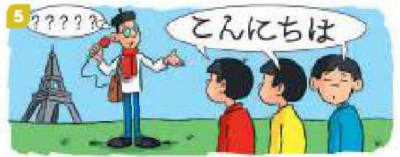
5 I wasn't a good tour guide because ...

B Now do Exercise A on page 53 of the Workbook.