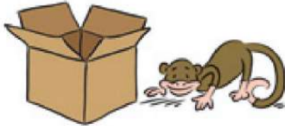
next to the box