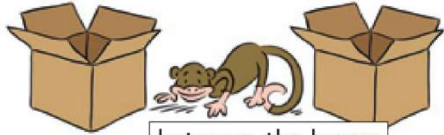
between the boxes