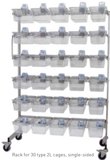
Rack for 30 type 2L cages, single-sided