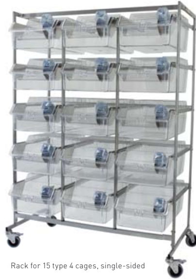
Rack for 15 type 4 cages, single-sided