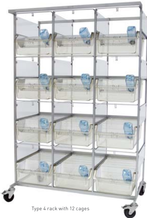
Type 4 rack with 12 cages