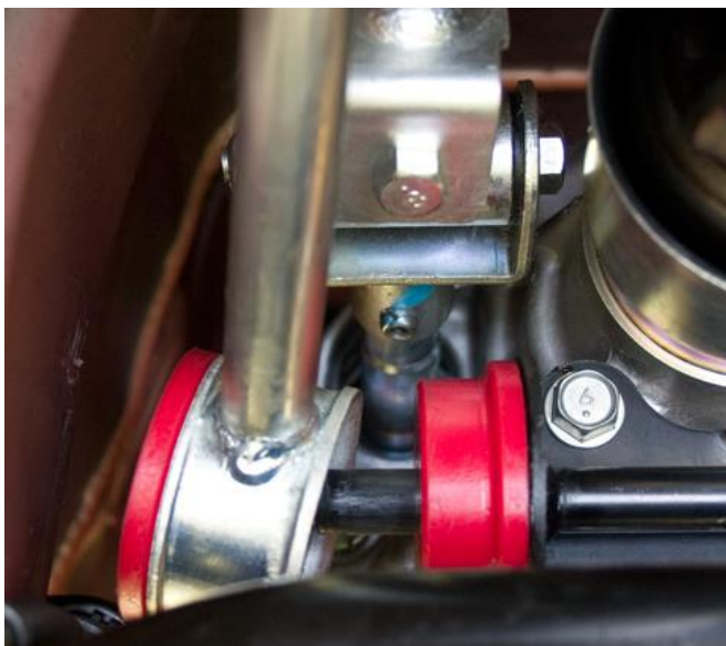
5spd shift rod being removed at tranny.