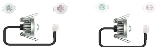
Open Area Lens