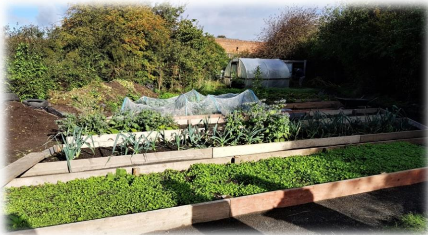
Picture 11 The main growing area, plot and storage site