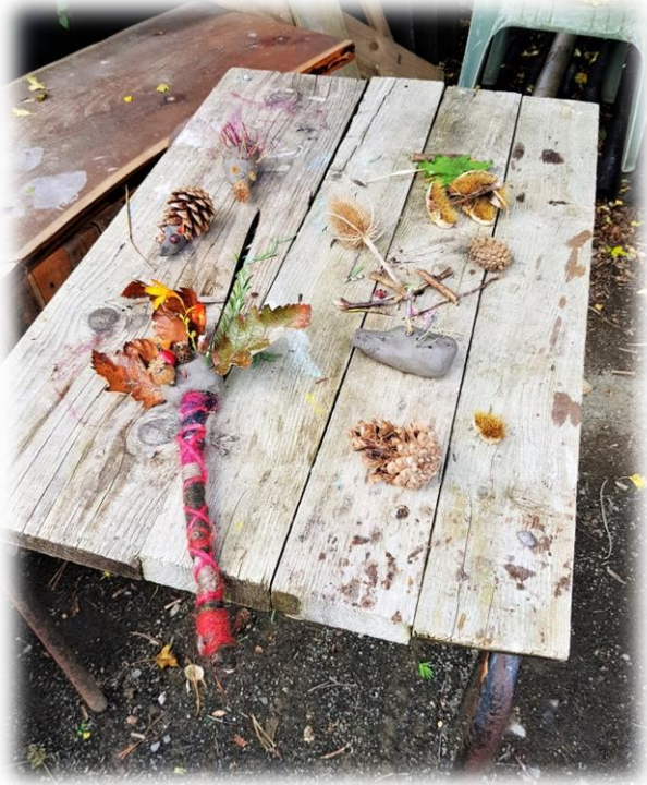
Picture 13 Outdoor Classroom