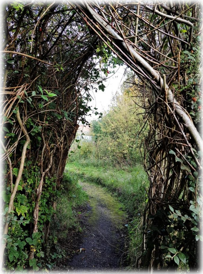
Picture 15 One of several willow tunnels