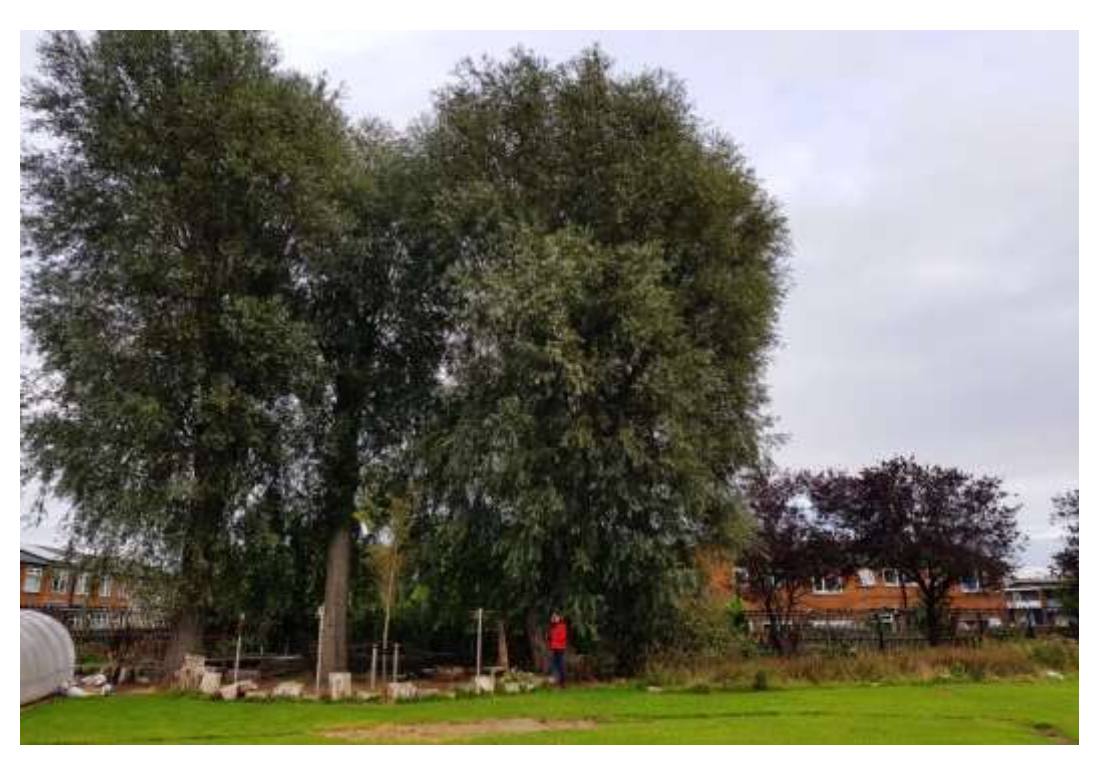
WILLOWS Cheviot School Outdoor Learning Centre