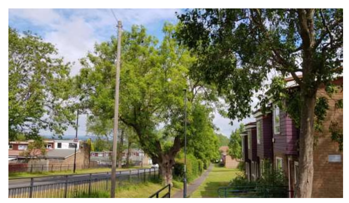
YEW Newbiggin Lane

Members of the Parish Council have begun to register some of our most notable trees, some examples are below. If you want to help us please contact us at <a href="www.woodlandtrust.org.uk">woodlandtrust.org.uk</a> You can learn more about the Woodland Trust at <a href="https://www.woodlandtrust.org.uk">https://www.woodlandtrust.org.uk</a>