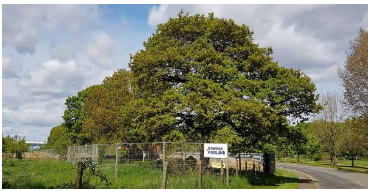
NINE OAKS Air View Park