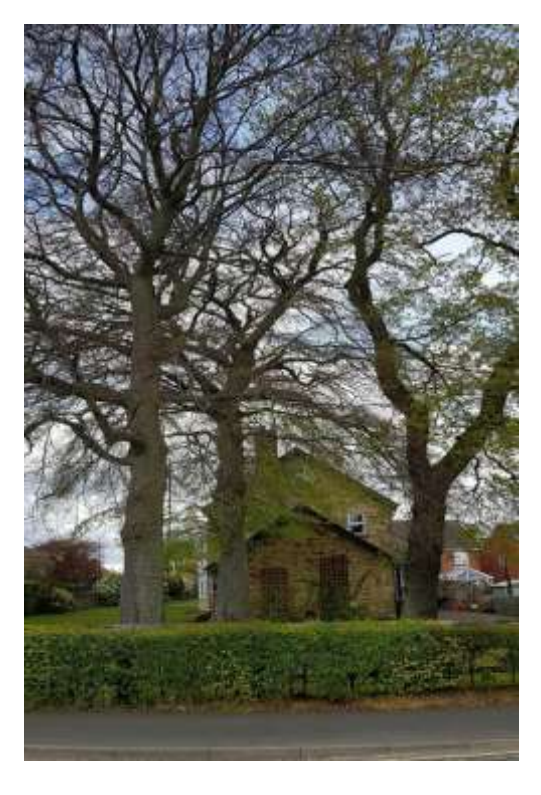
OAK and BEECH Corner of Brunton Road and Ponteland Road. Bank Foot