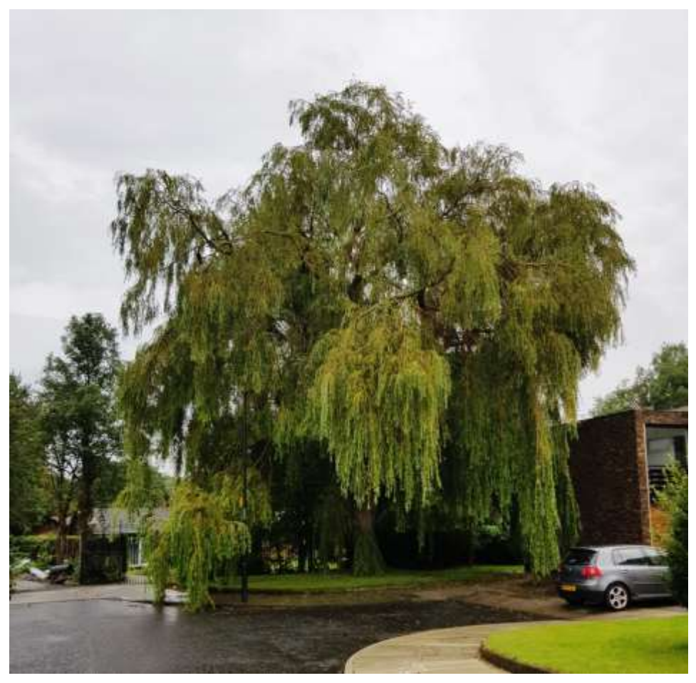
WEEPING WILLOW Bank Foot