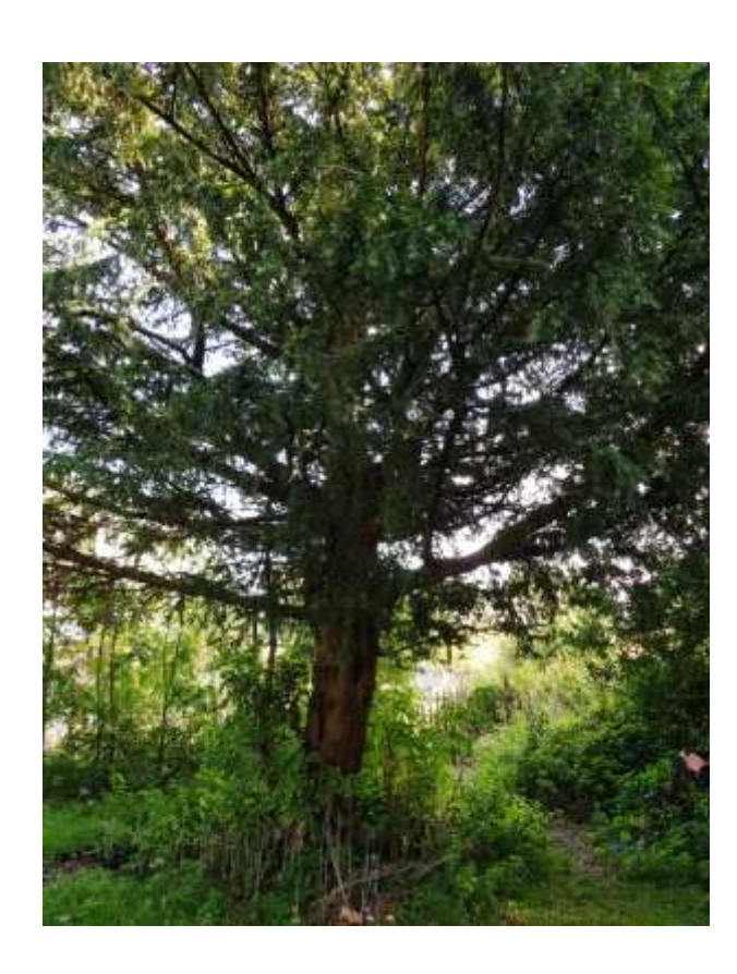
YEW (left) and OAK (right) Newbiggin Hall in the original grounds of the old Hall