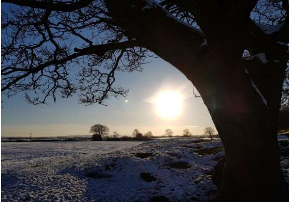
Winter skies overlooking Callerton