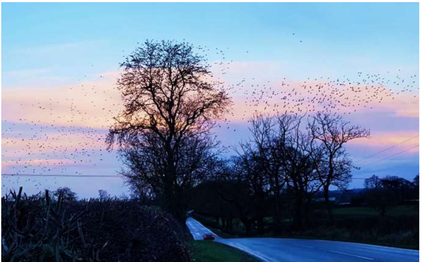
Black Callerton at dusk as Spring beckons