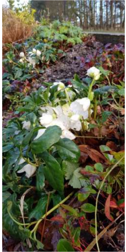
Christmas Hellebore, Woolsington