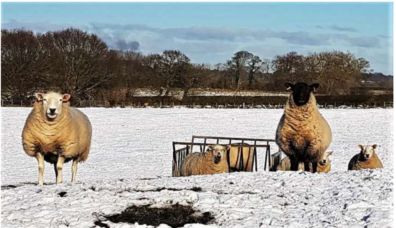
Sheep braving the cold in fields north of Callerton Village