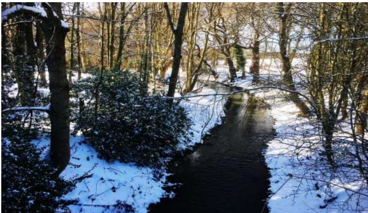
The Ouseburn River meandering through Woolsington