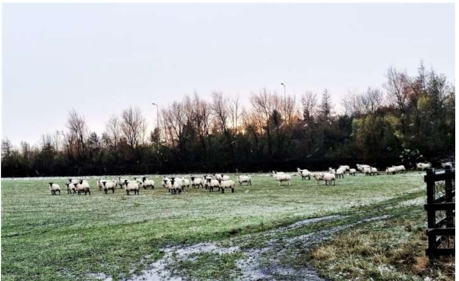
Winter grazing at Callerton Parkway