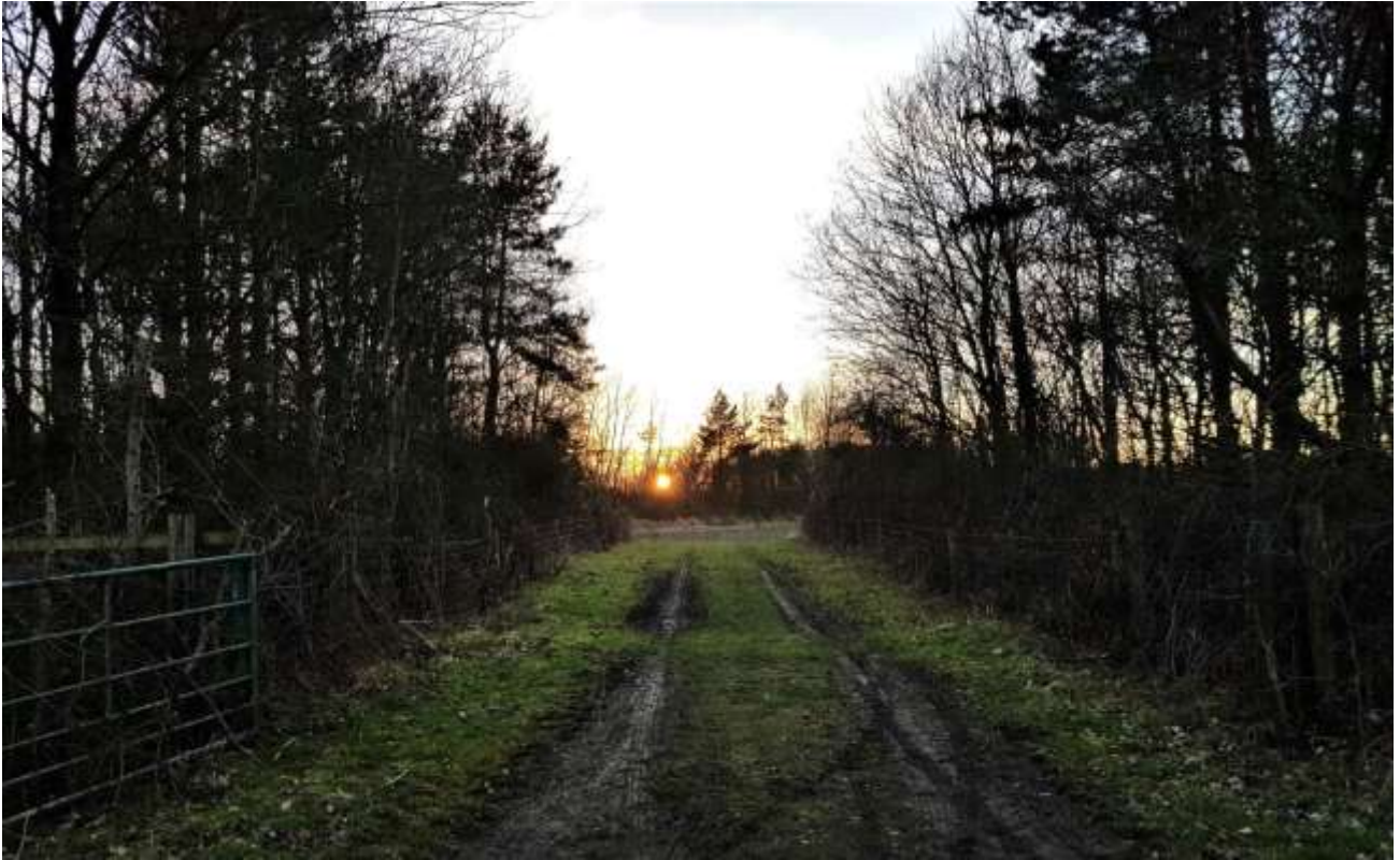
Sunset from Black Lane, the old waggon way between Woolsington and Lowbiggin