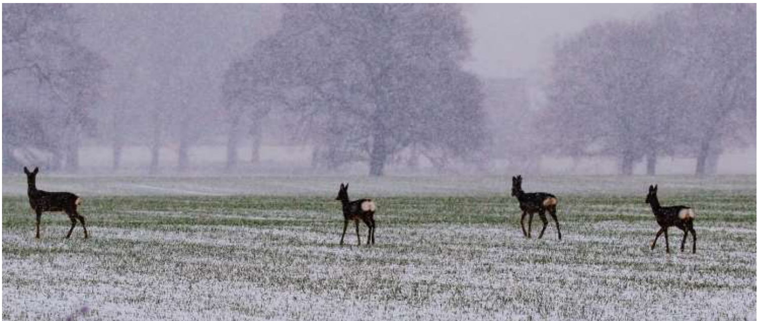
Roe deer in Woolsington Park