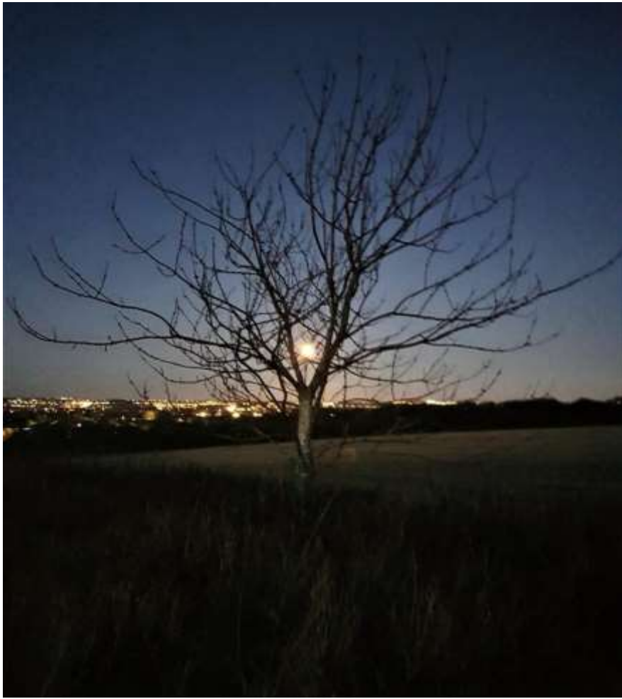
Darkness approaches in Bluebell Dene, Newbiggin Hall, with the lights of Kingston Park in the distance