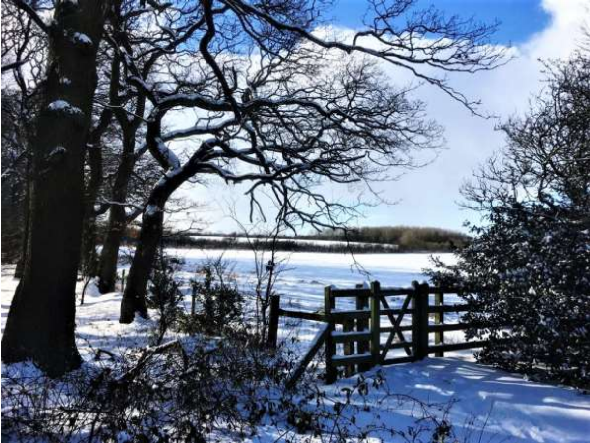
The farmer`s field, looking west from Woolsington Village towards the Metro lines