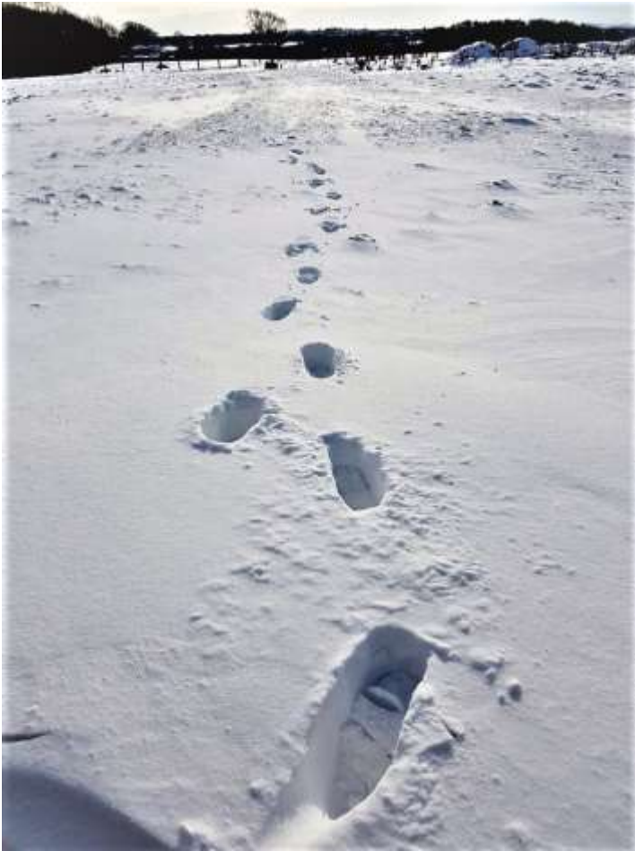
Snowdrift in Low Luddick, Black Callerton