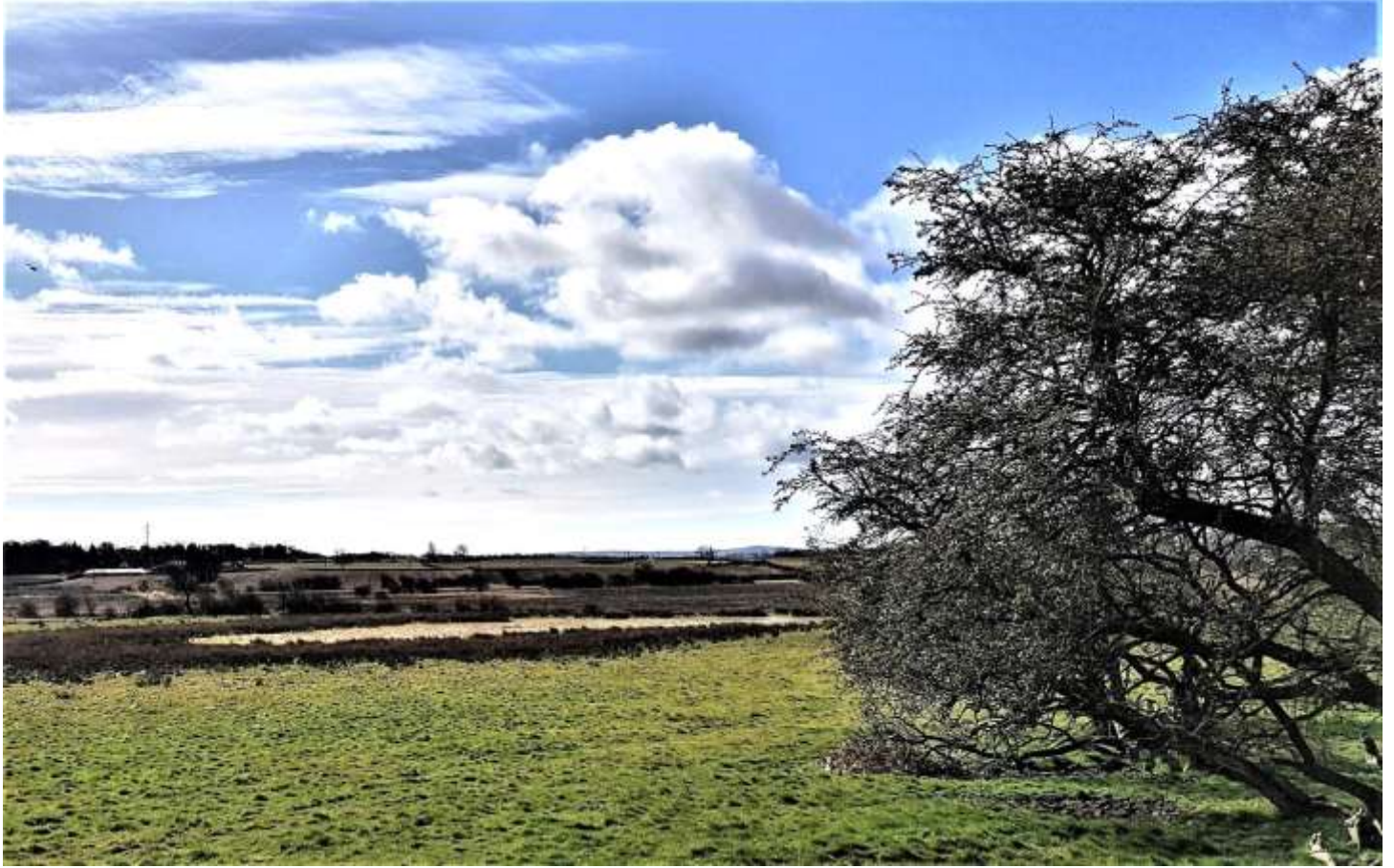
The Ouseburn is Newcastle`s only native river. The source is in Callerton, seen here looking west from Stamfordham Road.