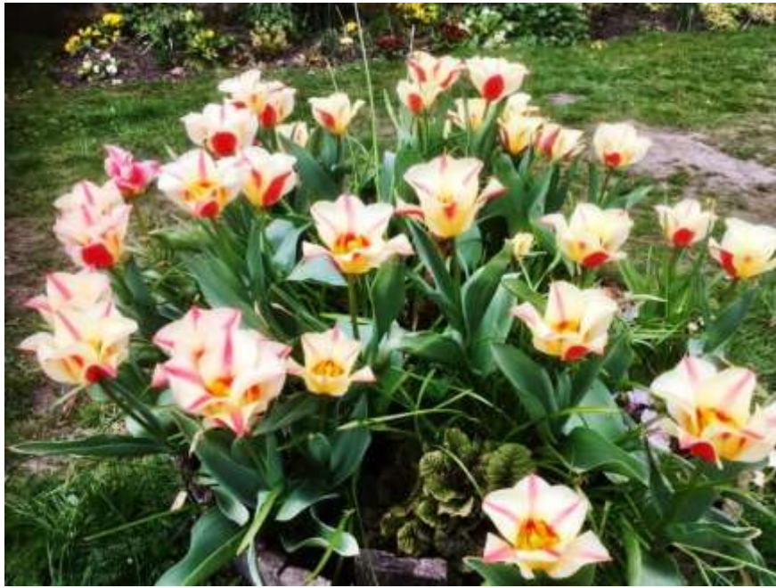
A barrel full of rockery tulips, Woolsington