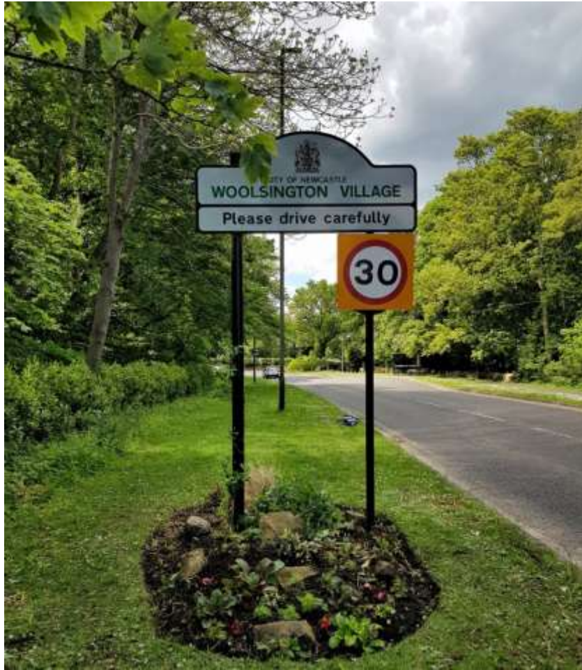
The southern approach to Woolsington Village on Ponteland Road.