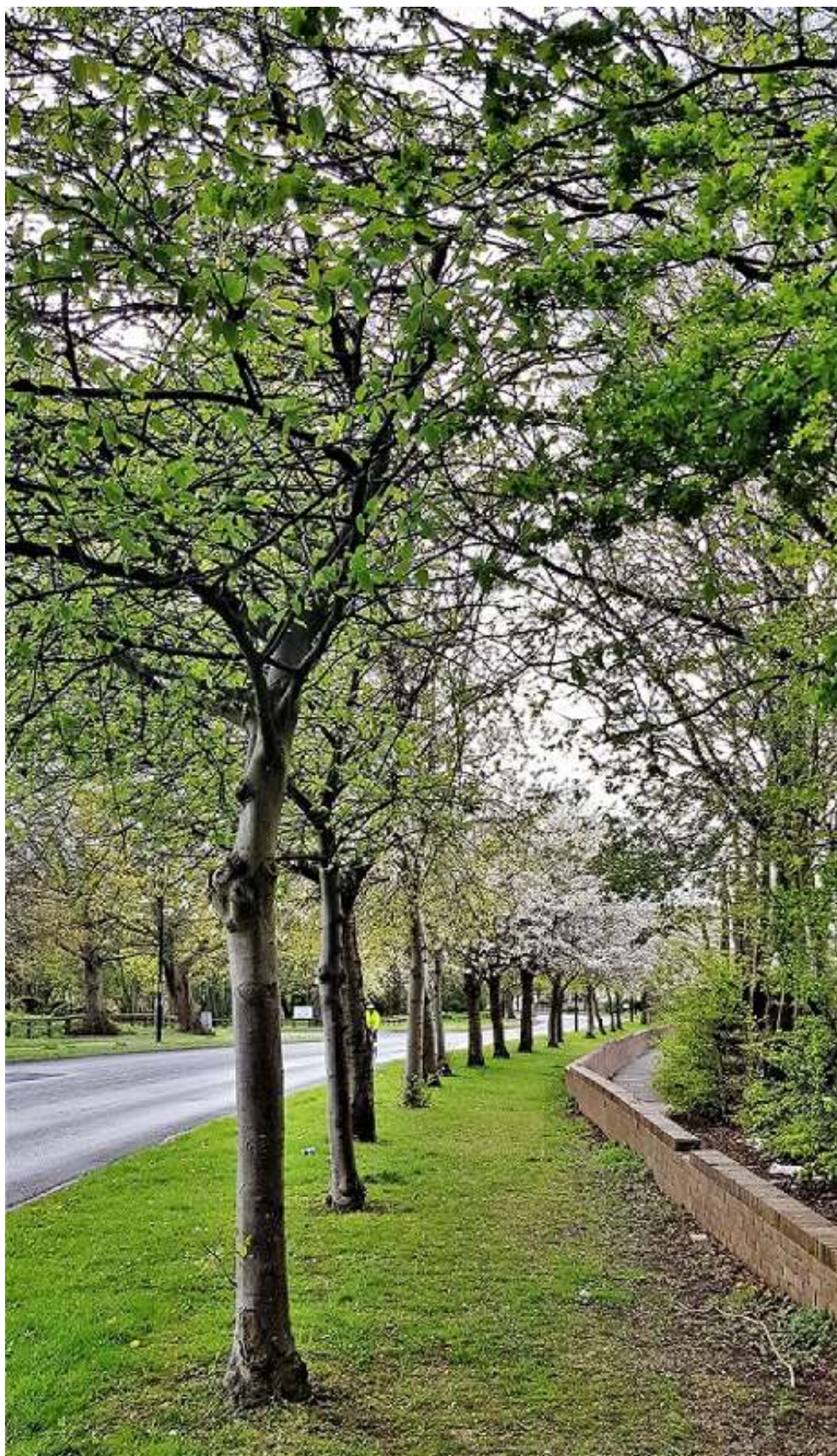
The majestic line of flowering Cherry trees on Newbiggin Lane, Newbiggin Hall