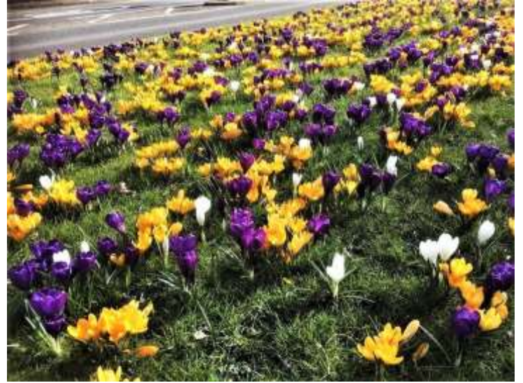
A glorious sight in Spring: The Crocus Carpet, Main Road, Woolsington