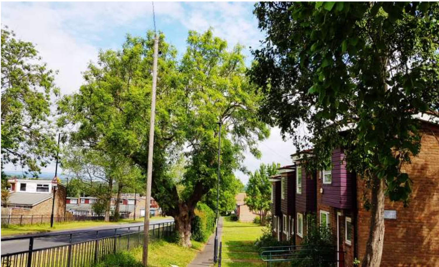
A magnificent and very old Ash tree. Originally part of a veteran hedgerow, Newbiggin Lane, Newbiggin Hall