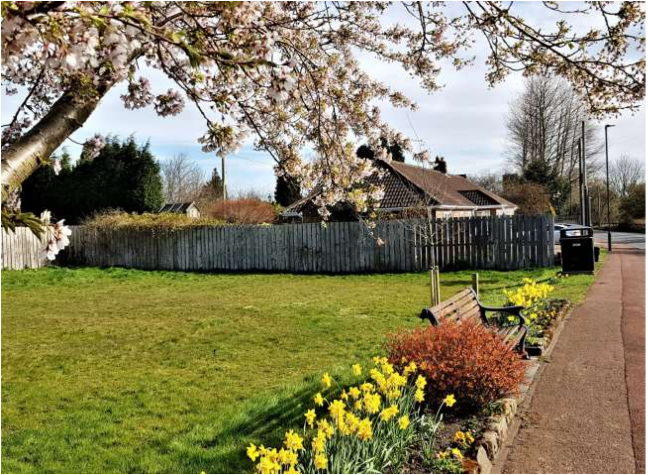
Callerton Village: beautifully maintained thanks to the efforts of local residents