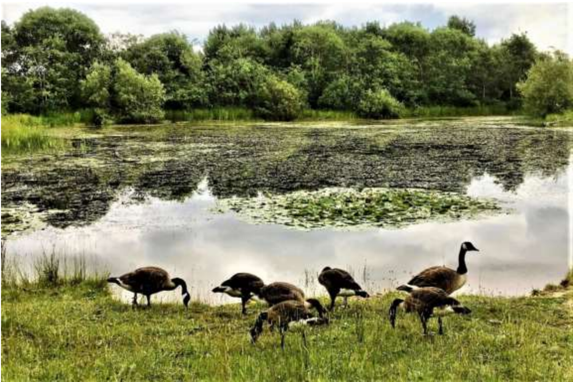
Two proud parents and 5 Goslings: A Canada Goose family at the Parish Ponds