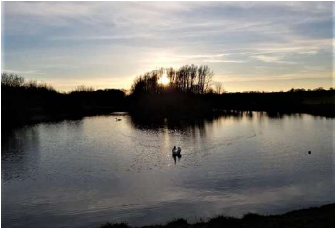
Swan Lake: Displaying Mute Swans at the Parish Ponds on a Spring evening