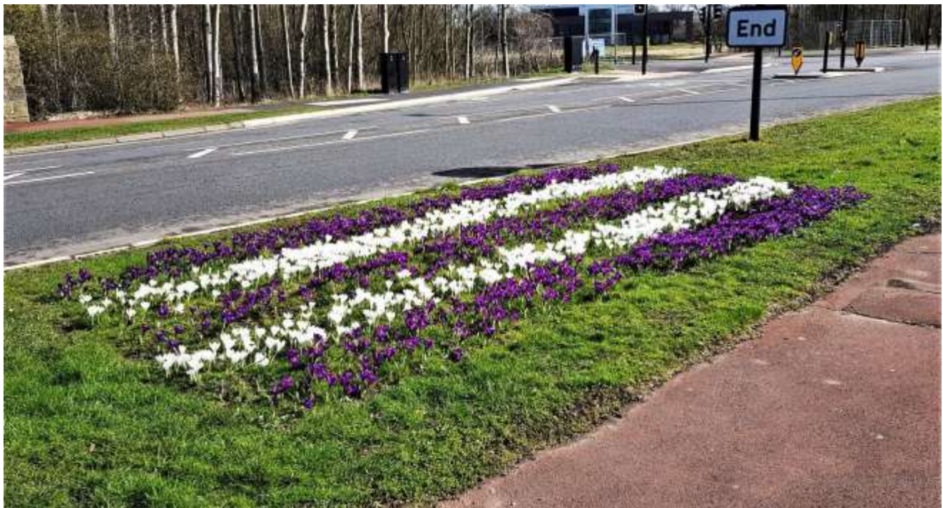
The Suffragette Flag, Wheatsheaf Farm, Woolsington: a crocus carpet designed as a tribute to the Women`s Movement.