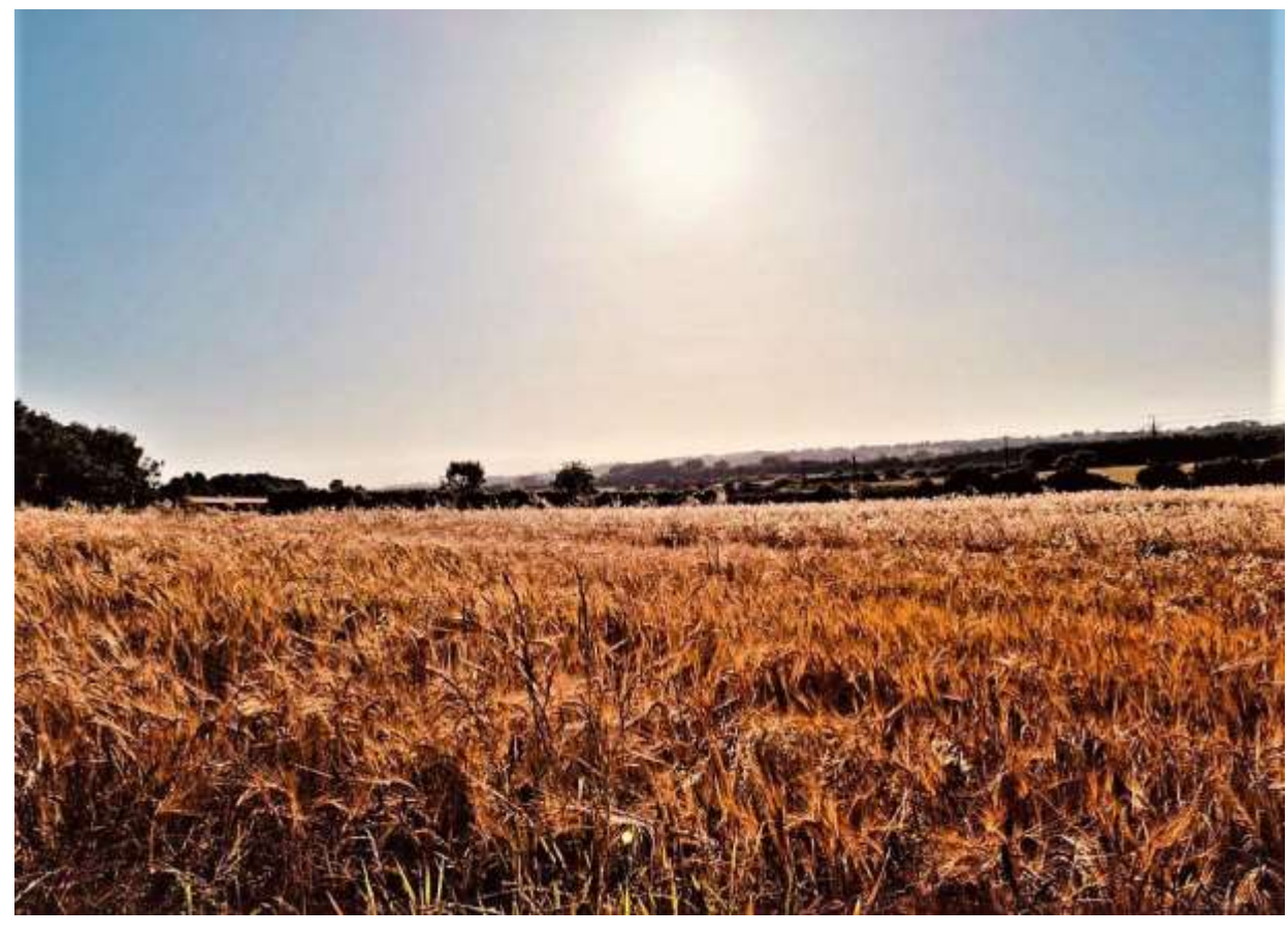
The Barley fields of Upper Callerton on a red hot day