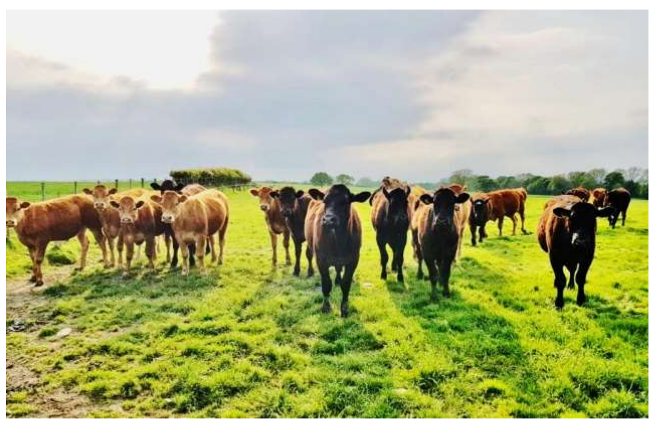
A very curious herd of Cattle at Low Luddick