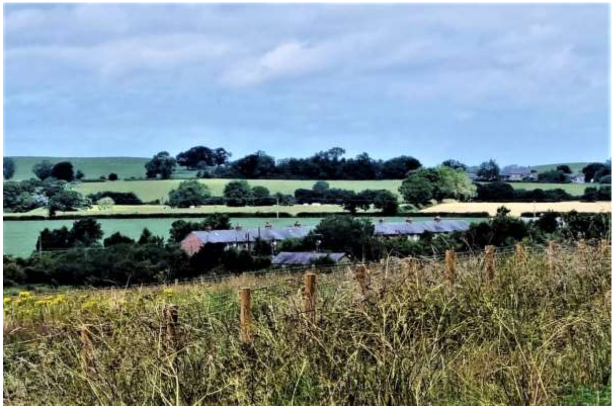
The old mining cottages in Callerton Village