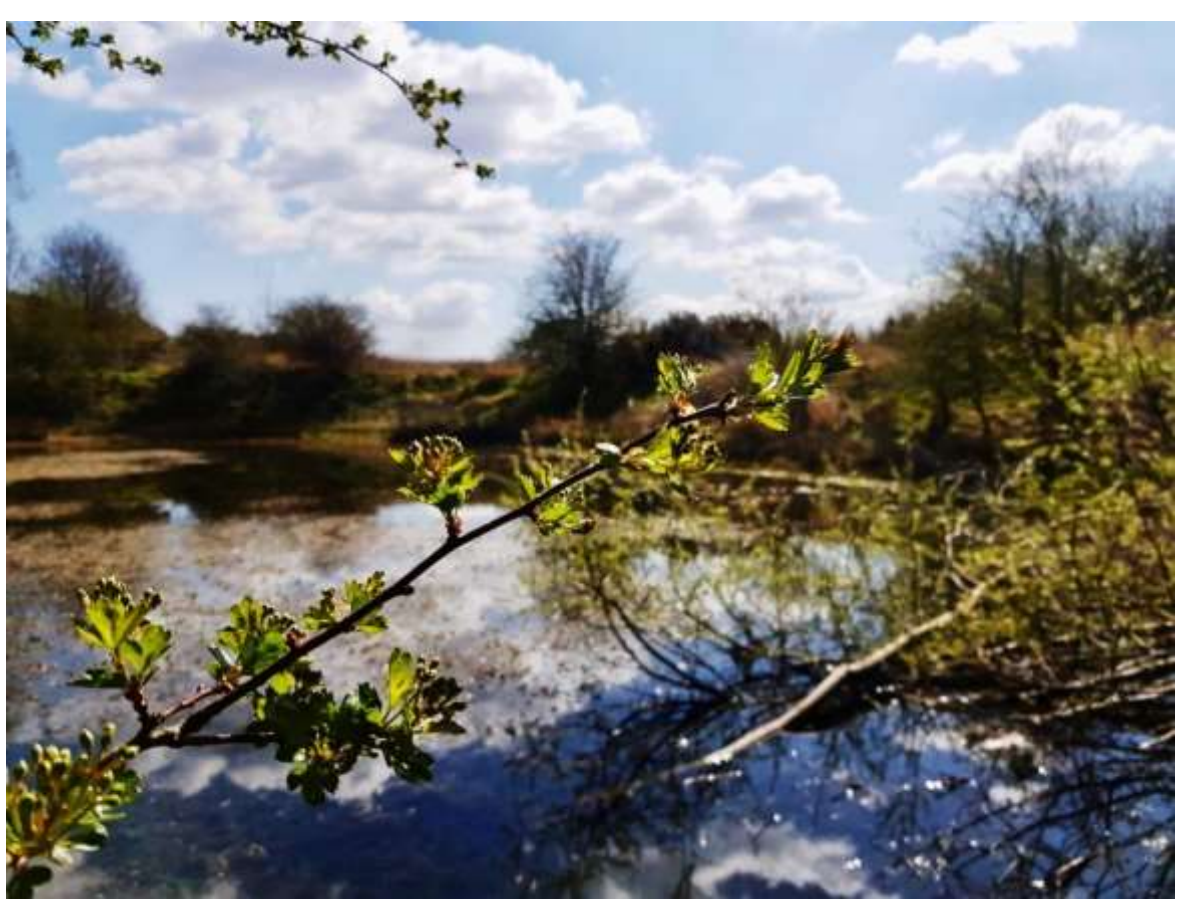
The Parish Ponds: a must for all ages, especially on a Summer's day