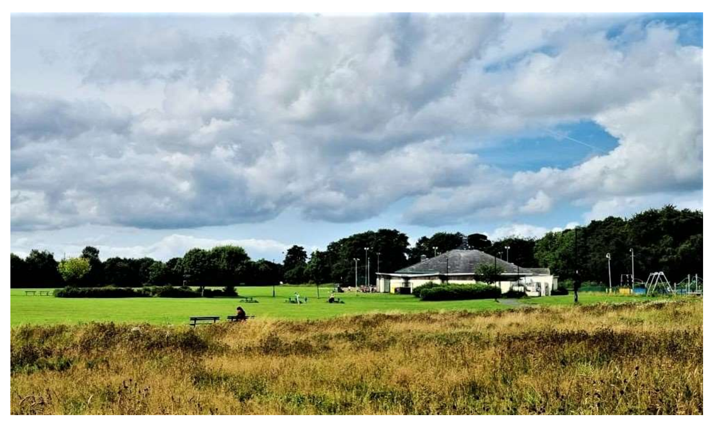
The grounds of the Galafield Centre, Newbiggin Hall