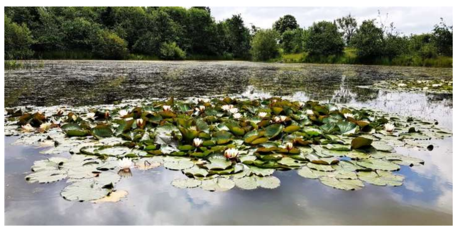
The magnificent Water Lily display at the Parish Ponds