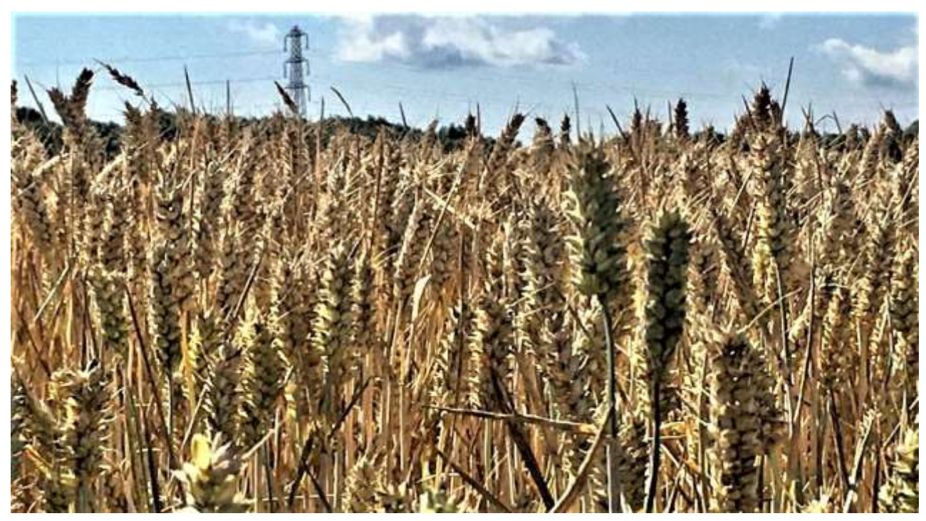
Ripening crops near Whorlton