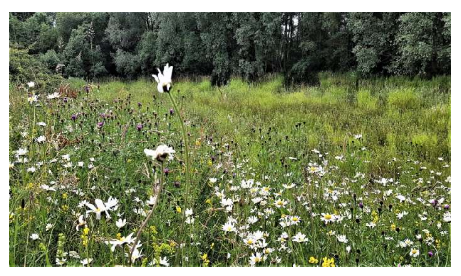
Wildflowers in abundance at the Parish Ponds