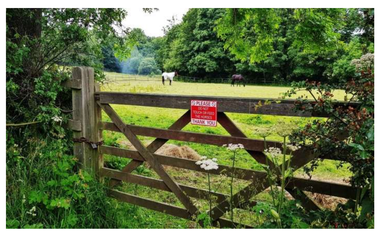
The paddocks, Callerton