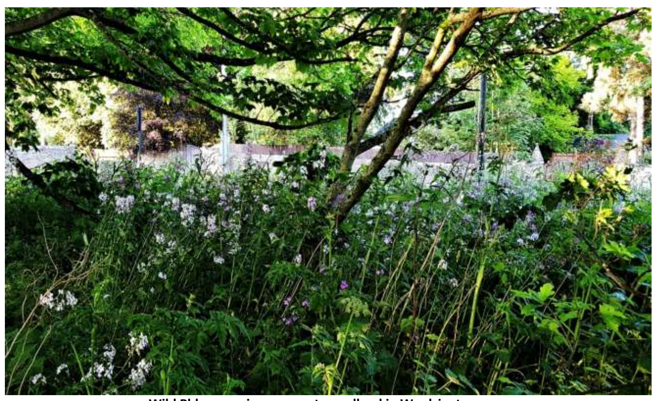
Wild Phlox growing amongst woodland in Woolsington