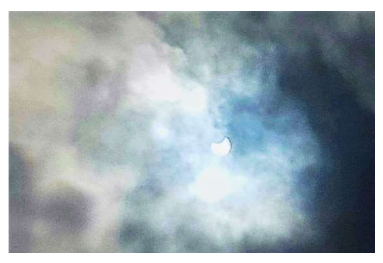
Partial eclipse of the Sun in July going completely unnoticed by the cattle, Callerton