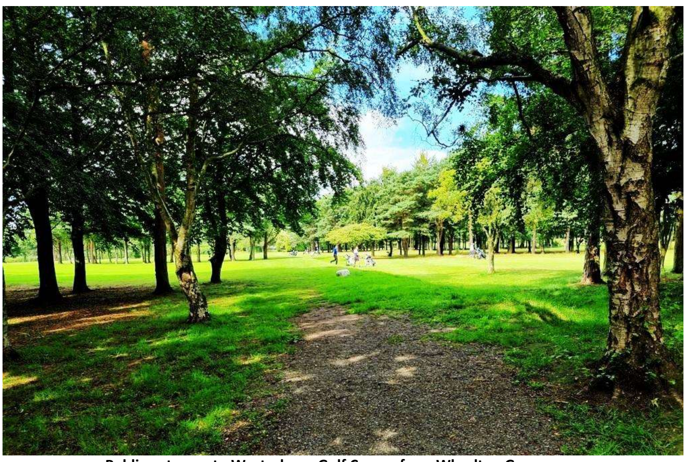
Public entrance to Westerhope Golf Course from Whorlton Grange