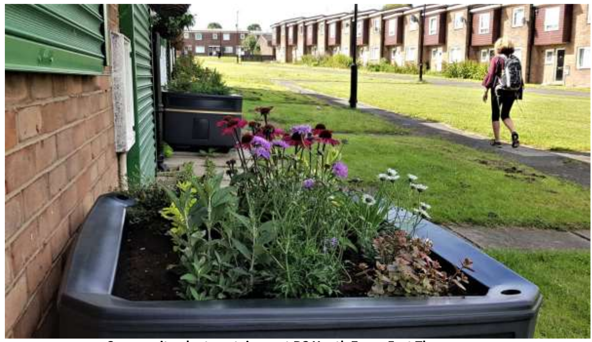
Community plant containers at D2 Youth Zone, East Thorp