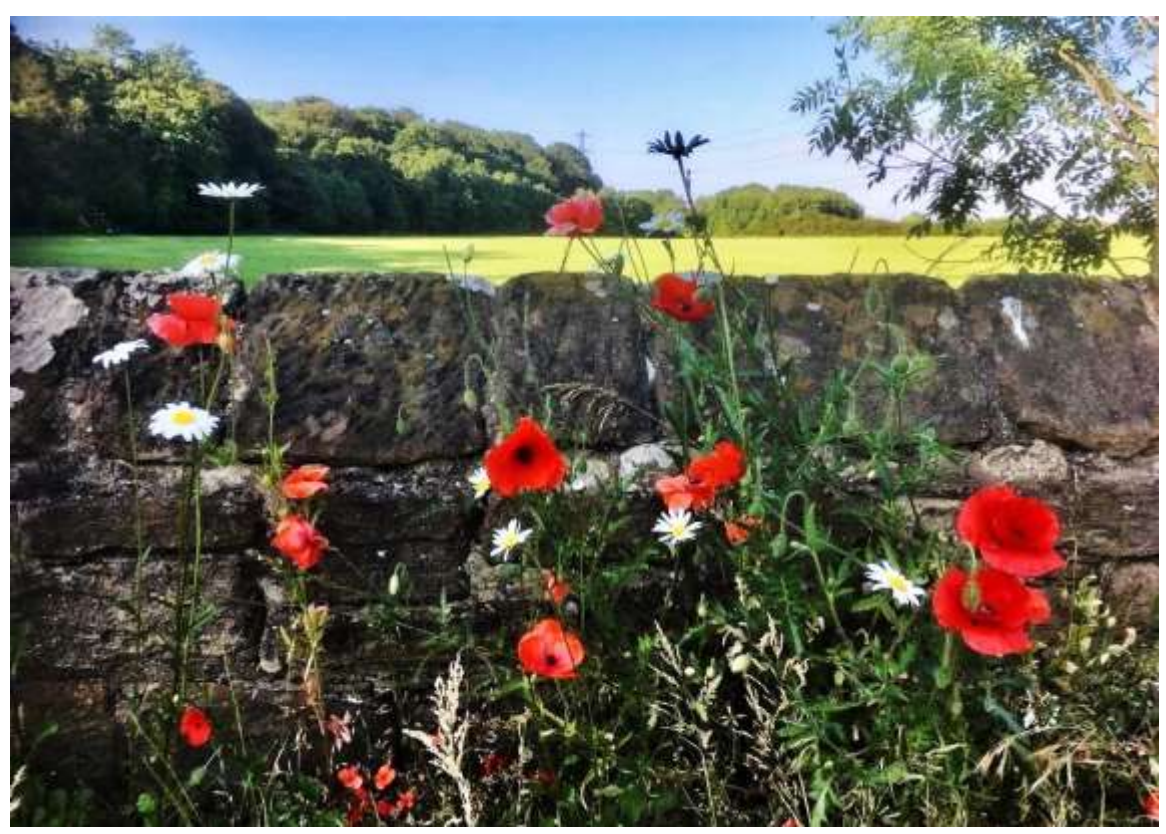
Bank Foot: Wildflowers now populate sections of the old stone wall on Ponteland Road