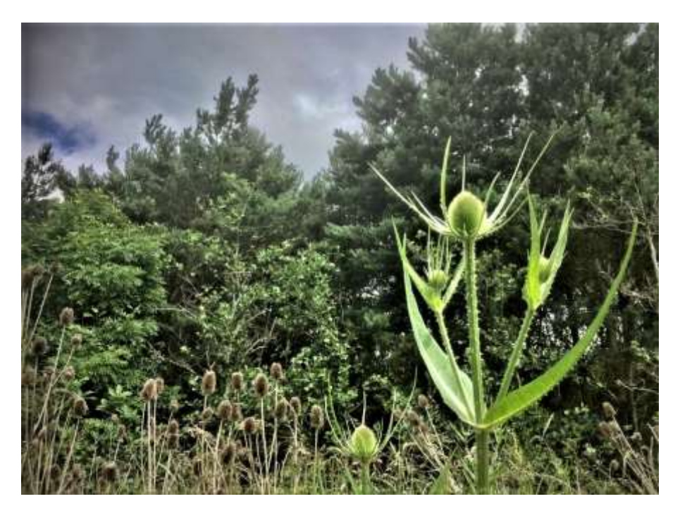
Ponds Bridleway: Teasel and Common Orchid, flourishing in the summer sun