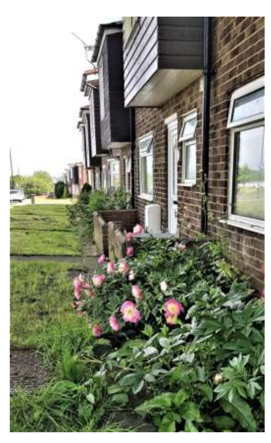
Peony Rose, Bedeburn Road