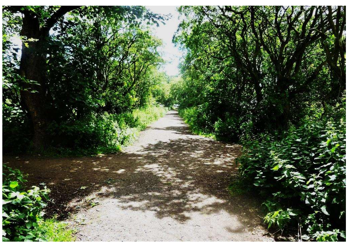
A section of the old waggon way from Westerhope to Lowbiggin, thought to have been in use since the 18<sup>th</sup> Century