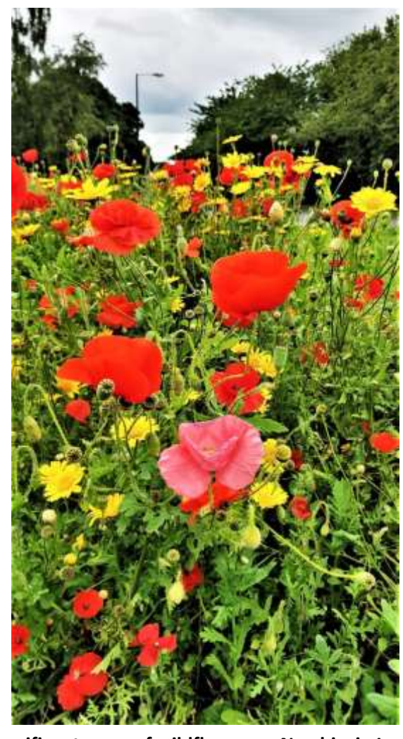
Magnificent array of wildflower on Newbiggin Lane