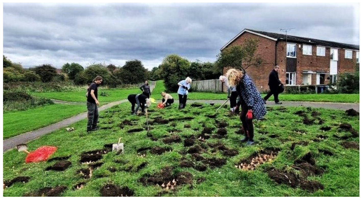
Some hours later, as the job nears completion, the turf gets replaced