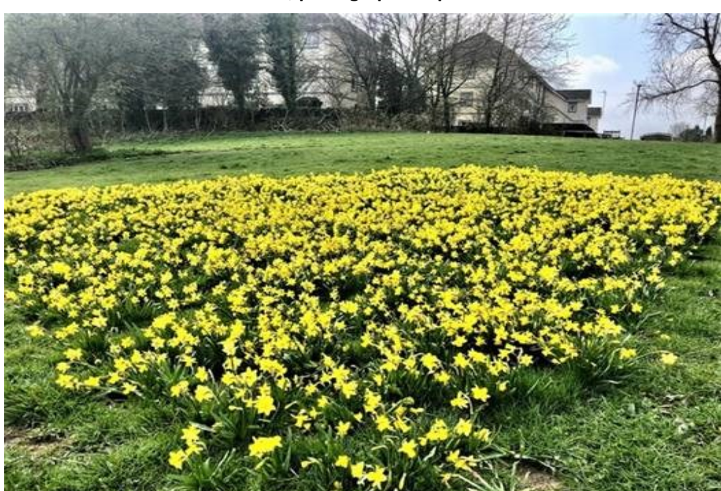
Phase 1 results, photographed April 2022

In Phase 1 Costain Jacobs, the civil engineering company who are currently upgrading the A1 in our region, supplied over 5000 spring bulbs, the mini daffodil Tête-à-Tête. They also supplied a volunteer task force from their staff, who turned up in numbers in October 2021 to help plant the bulbs at the eastern entrance to the Dene.