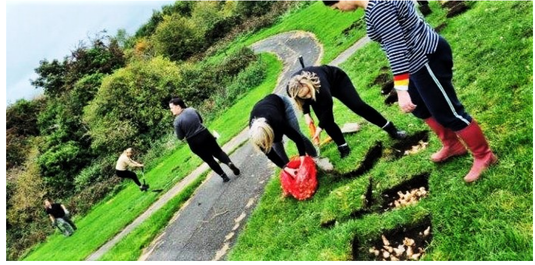
The first bulbs begin to get put in the ground with careful, systematic, planning