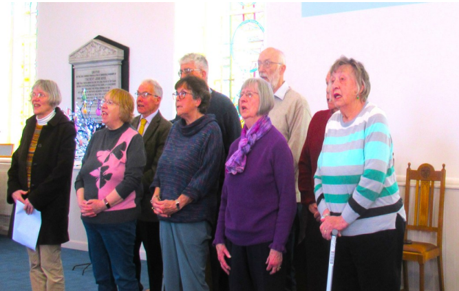
Some of the activities on Easter Sunday Decorating The Cross, Egg Tree, Easter Bonnet and Choir Singing