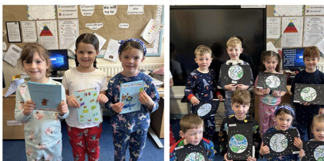
Children in P1-3 at Letham Primary celebrated Sir David Attenborough's 100th birthday! They made cards, planned themed cakes, parties and each made a pledge to our planet!