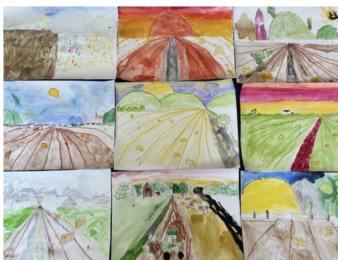
3D perspective art work from our Primary 4 class at Letham Primary School. Theme: Farming