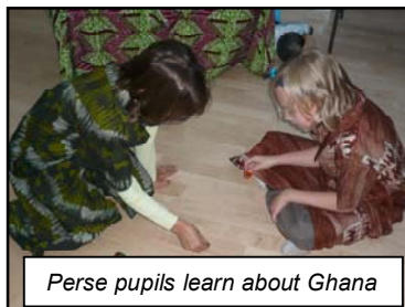
Perse pupils learn about Ghana