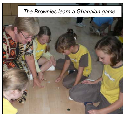
The Brownies learn a Ghanaian game

We hope that this relationship between the children can continue well into the future.