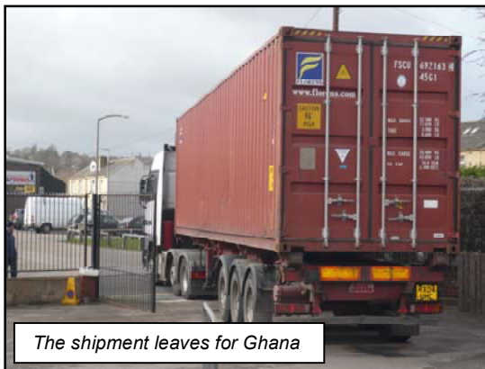
The shipment leaves for Ghana

In addition to our items, and some items for other charities, CART filled the remaining space in the 40 foot container with boxes of clothing, medical supplies etc, and even bicycles, to be distributed free of charge to the community in and around Kaleo. In total we sent 84 boxes for the Nursery School, with a volume of over 200 cubic feet, and CART sent 184 boxes.