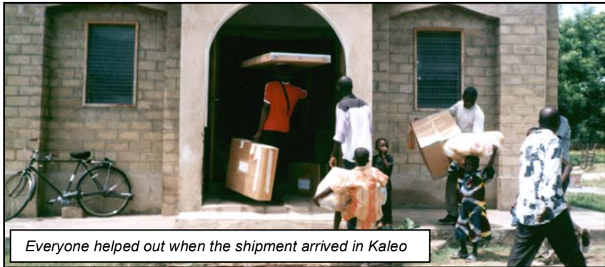
Everyone helped out when the shipment arrived in Kaleo

As you know, this whole project started when we sent a range of building machinery to the church in Kaleo in 2004. Now that the building is completed, the building team are working to set up a small business. They have had enquiries about supplying both roofing tiles and floor tiles. They already have 50 roof tile moulds, so as part of this latest shipment we sent them 100 floor tile moulds. The team has made enquiries with local contractors and hope to be getting some large orders in soon.