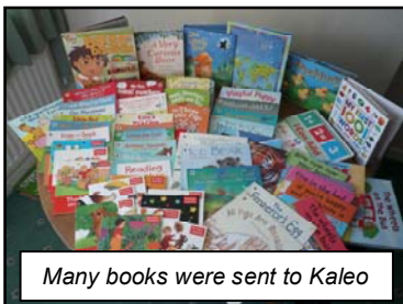
Many books were sent to Kaleo