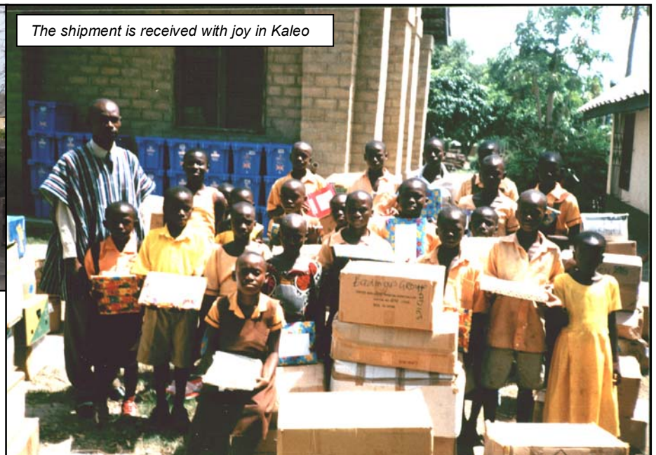
The shipment is received with joy in Kaleo