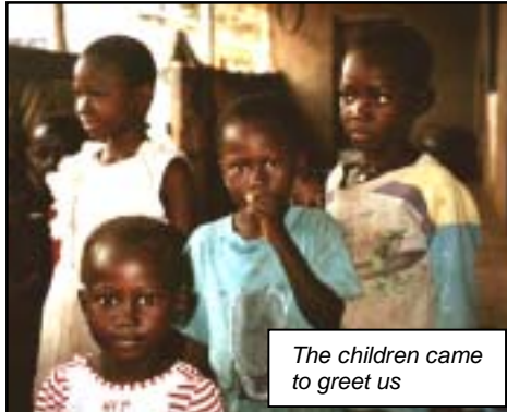
The children came to greet us

had no basic education as they often cannot do the most basic of tasks. Members of Kaleo Baptist Church recently held a meeting to discuss the creation of a nursery and are extremely enthusiastic about it. We all want the nursery to be free to attend and so available to all, to