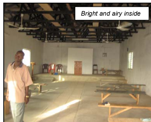
Bright and airy inside

The newly built church in Kaleo is now complete both outside and inside. It is used every Sunday for worship services and it is hoped that soon the new Kaleo Baptist Nursery School will also start using the building. The building is admired by the Pastor, congregation and visitors and is a shining example of what can be done in this remote part of Ghana. Congratulations to all those who worked so hard to design and construct this wonderful building.