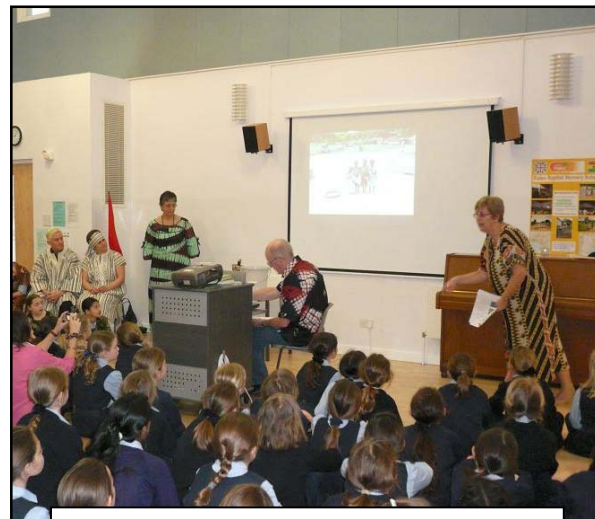
The children are fascinated to learn about Kaleo

The school run a Brownie Pack and they have been keen to raise money, contributing £212 from a sponsored silence. The Brownies have also asked if they could write to some children in Kaleo. We hope this Pen Pal scheme will be a permanent venture and anticipate this could be up and running at the start of the new school term in September.