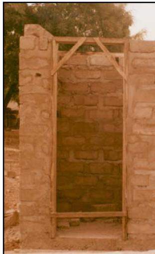
The toilets under construction

One shipment of equipment has already been sent to Kaleo and at present we are getting together a further shipment consisting of books, toys and musical instruments suitable for the children's age group and of course all having educational value.