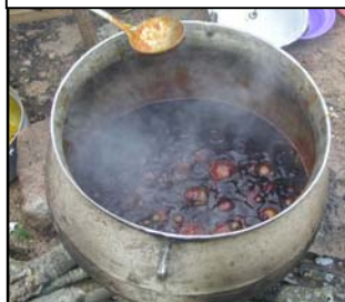
Palm nut soup