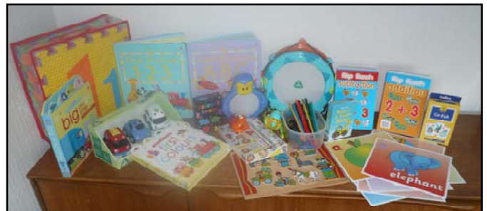
Some of the toys, books and resources that will be sent to Kaleo

Thanks to you all, this work can and will continue.