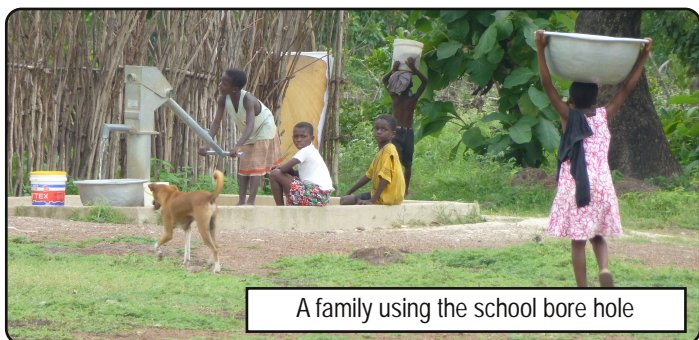
A family using the school bore hole