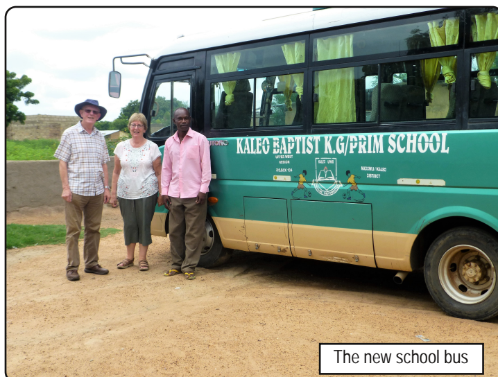
The new school bus