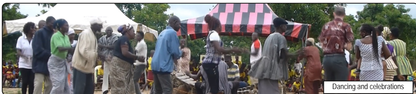
Dancing and celebrations

example of the wonderful fund raising events held for Care for Kaleo by people and churches inspired by the work. Thank you all for what you do to help the children of Kaleo.