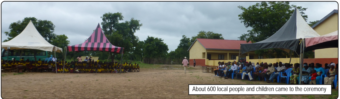
About 600 local people and children came to the ceremony

their own children. We were invited to a Thanksgiving Ceremony where we handed over to the Ghana Education Service (GES) the Kindergarten and Primary School along with toilets etc. The GES promised to maintain all the buildings.