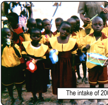
The intake of 2009. Then and now