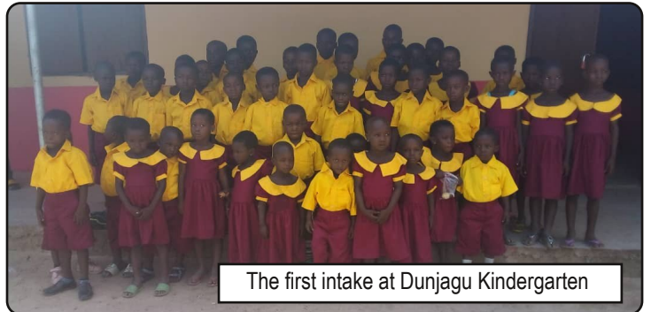
The first intake at Dunjagu Kindergarten