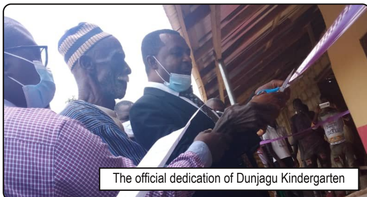
The official dedication of Dunjagu Kindergarten

We have decided that we will provide the money to pay for a daily school meal for every student in Dunjagu until they start receiving meals through schools feeding program. Currently this is just for the Kindergarten, but it will also include the Primary School, once it is up and running.