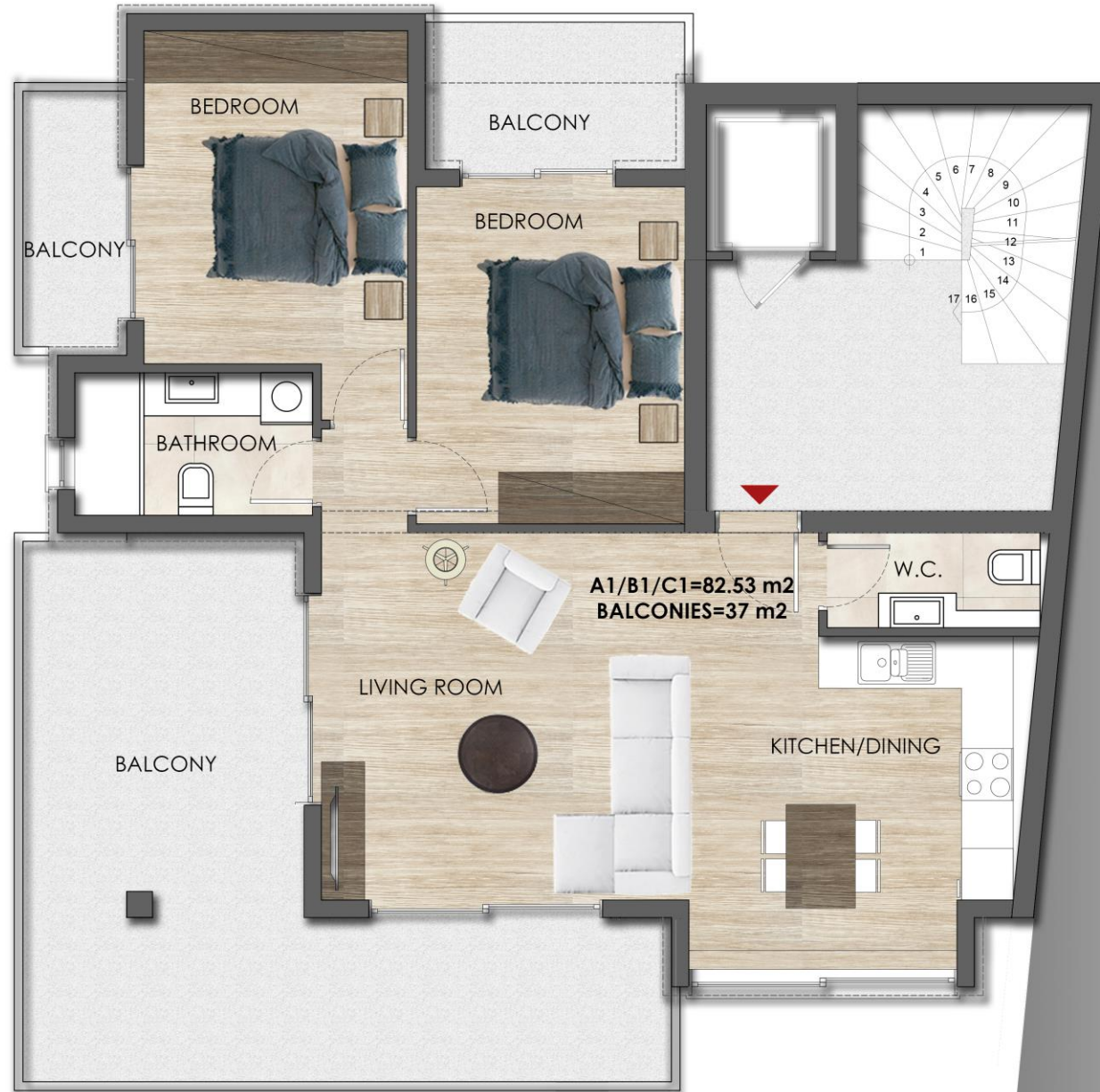
KOLOKOTRONI Str FIRST / SECOND / THIRD FLOOR