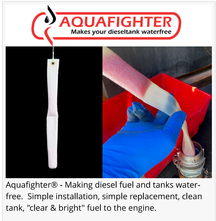
Aquafighter® - Making diesel fuel and tanks water-free. Simple installation, simple replacement, clean tank, "clear & bright" fuel to the engine.

ORLANDO, FL, USA, April 7, 2021 /EINPresswire.com/ -- Aquafighter® , a new technology for keeping fuel water-free, is establishing distribution in the marine market worldwide. Steve Schultz of DieselCare AS makers of Aquafighter®, "In 2020, our first year at market; we focused primarily on the fuel station market as those are our roots. However, we see the marine market as having quite possibly the most potential for our non-additive, non-energy consuming, easy to use fuel purifying technology."