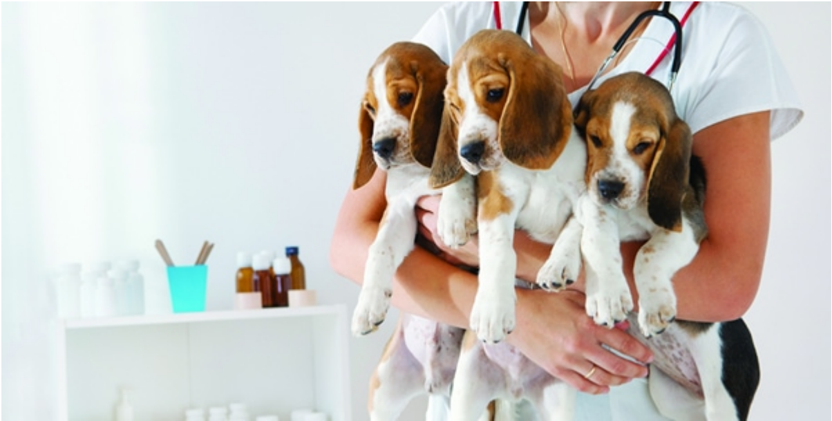
The scandal of vaccinations for dogs

I have been writing about the dangers of over-vaccinating dogs for many years.