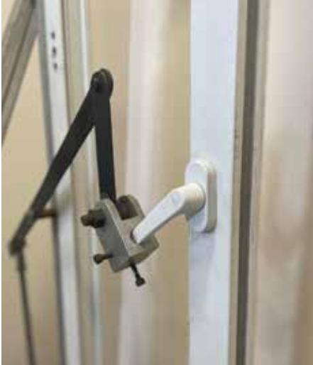
Product Cycle Testing Machine

has been one of our biggest strengths. Successful delivery of projects is what has added to our brand over time.