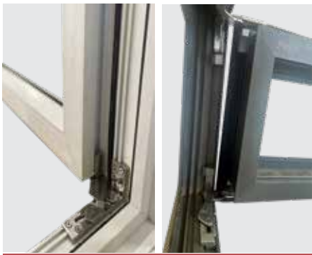
PEGO has strong presence in Aluminium & uPVC hardware

Architects, consultants & window manufacturers are constantly looking for new out-of-the-box solutions for architectural hardware. How critical it is to evolve and innovate & what are the challenges faced along with this?