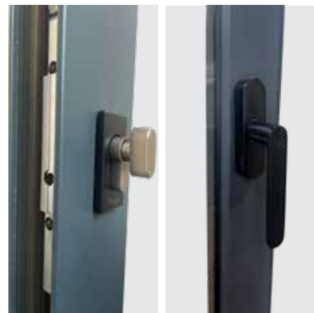
Innovation is the focus point at PEGO

solutions has been phenomenal. Ease of information, lots of exhibitions and events, social media & world becoming one big continent in the end, have made strong demands coming from the architects, consultants and end users for such solutions. I also strongly believe innovation is the best way to distinguish oneself from others more when standardisations aren't there at a bigger level.