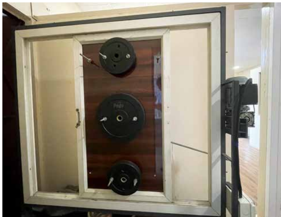
Roller product cycle testing machine at Application Centre

With awareness activities being conducted by associations and various stakeholders I am optimistic that things would get better with time.