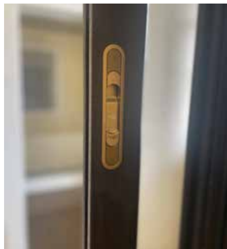
At PEGO, durability, performance & functionality of the product is never compromised

In the last financial year, we have witnessed 45% growth YoY. I can say that it would not be very different in the current year as well. And I can confidently say it is not true for only our organisation but the fenestration industry in India at large with the percentage being a bit different. While the bottom line has been hurt significantly because of fluctuation in raw material prices but the growth of the topline has helped in keeping the organisation healthy