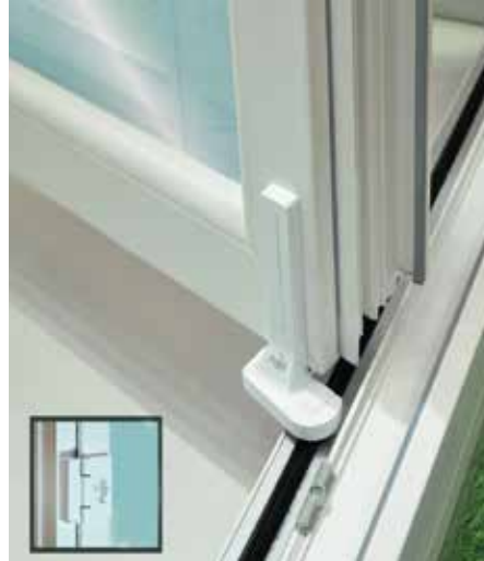
Sliding Folding Hardware

Our Application Centre at our head office in Sahibabad has been the biggest value addition which has helped us in sharing our latest innovations with our customers. It gives them the opportunity to witness the application of the product along with a touch and feel experience. Understanding of the product becomes