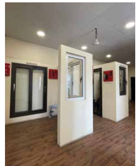
The Application Centre at the head office in Sahibabad has helped PEGO in sharing its latest innovations with customers