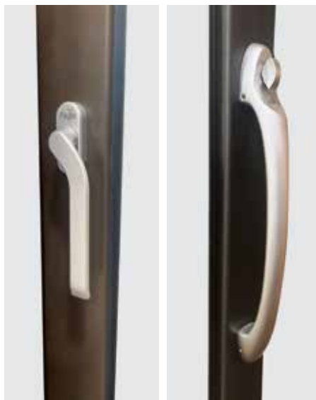
Pushing the benchmark and creating innovative designs

There would be consolidation and entry of big corporate houses which would further push the growth of this industry. We have already witnessed activities in this direction.