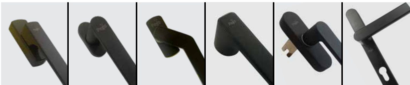
The concept of one family hardware: Sorano Series

My answer to this question will be very specific to only the fenestration industry in India. The splurge in demand posts the first lockdown has been more than what any of the pandits had predicted. It has made us all realise that while the nature of lockdowns will remain uncertain but the business will remain intact and positive.