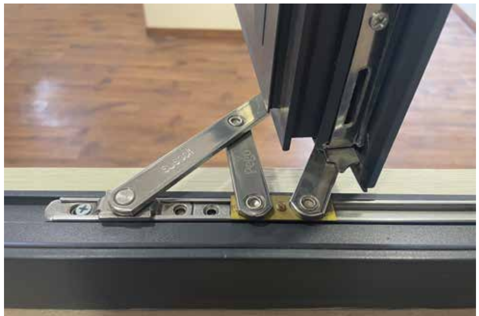
Fenestration Hardware of high durability

However, customer appreciation, loyalty and references are intangible yet biggest assets, which can never be traded. This