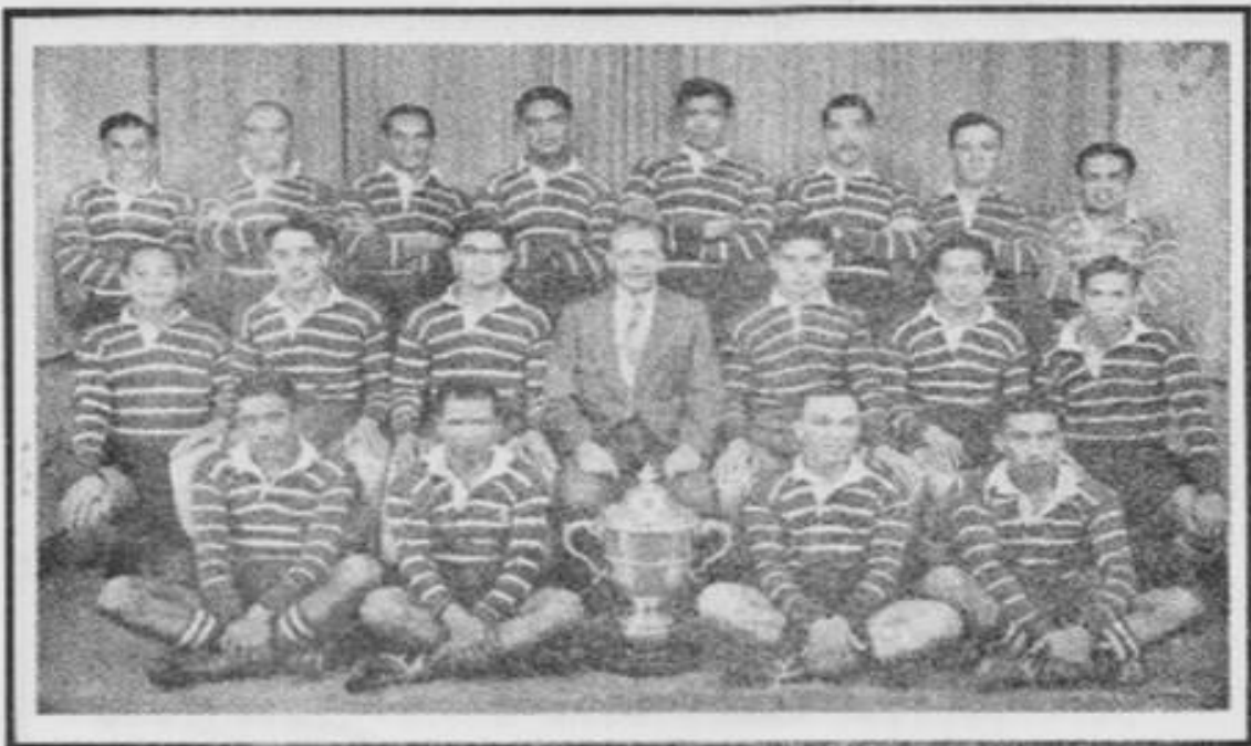
THE 1947 GRIQUA TRIPLE CROWN CHAMPIONS