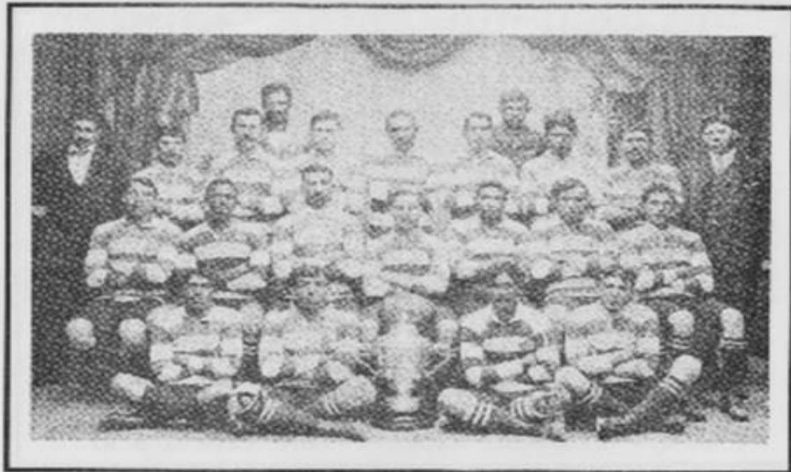
THE 1907 GRIQUA TEAM