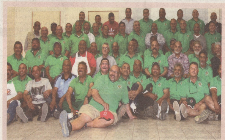
RELIVING THE PAST: About 150 former rugby players from different generations met to reminisce over the good old days after nearly 20 years while watching the Springboks beat Samoa on Saturday.