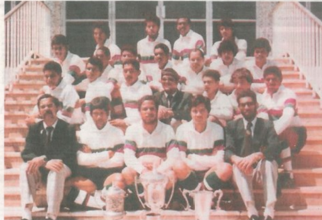
BONDING: Teammates of Arabian College Rugby Football Club were, to start with, united by the sport they loved but off the field they also cared for one another through thick and thin.