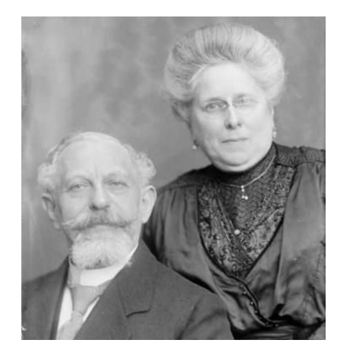
ELKA for: Edouard Louis Kiek Amsterdam

Founded in 1877 in Amsterdam by Eliazer Kiek, inventor of the tactile watch for the blind and watchmaker to Queen Juliana of the Netherlands. In 1949, the Elka Watch opened its Swiss branch in La Chaux-de-Fonds (it produced wristwatches of course but also pocket watches, braille watches, chronographs, chess and signal clocks). Then, in the mid-1970s, the brand disappeared along with Ernst Louis Kiek, grandson and last heir.