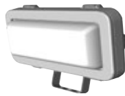
GGMC? 9'ACI BH