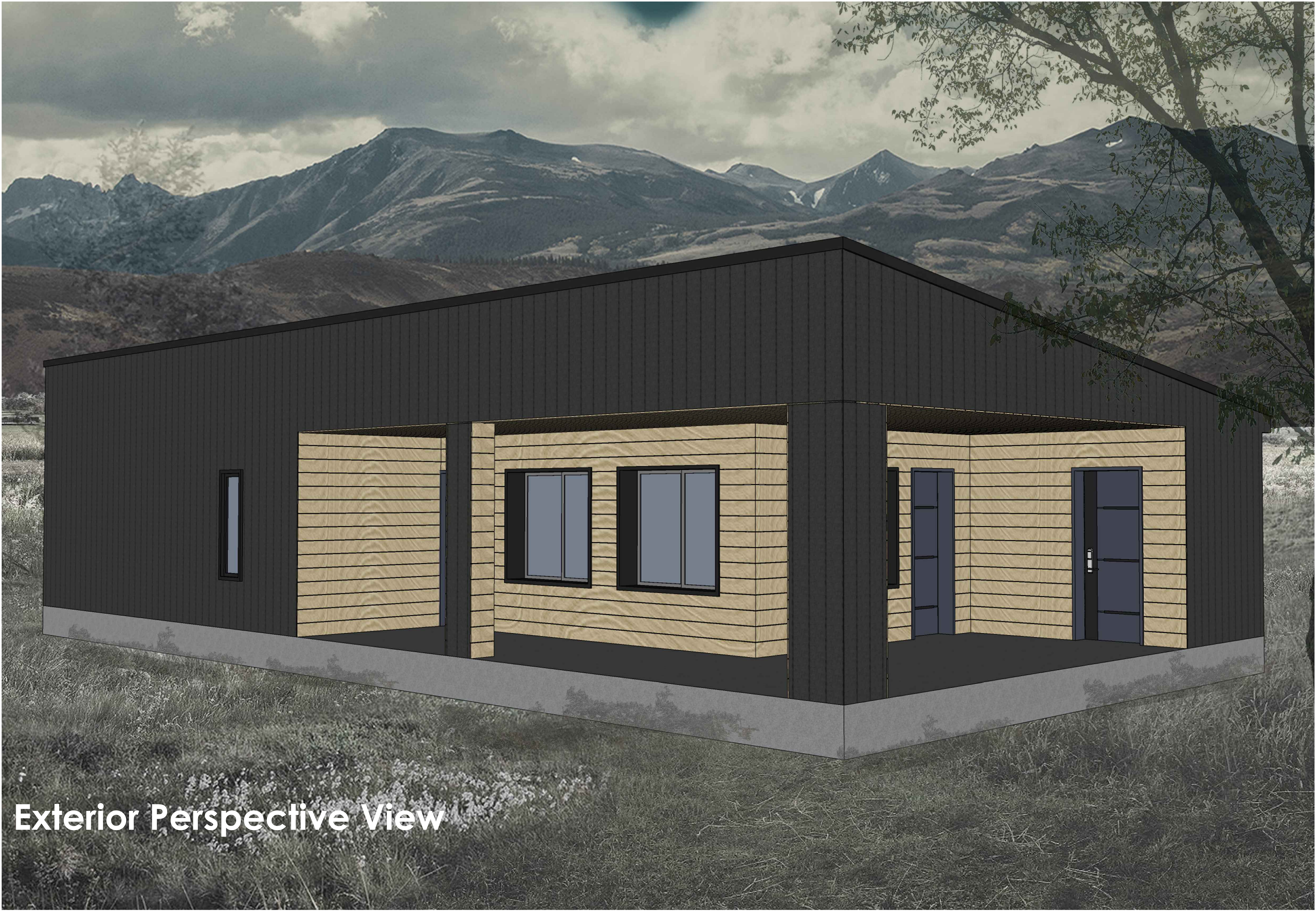
Exterior Perspective View