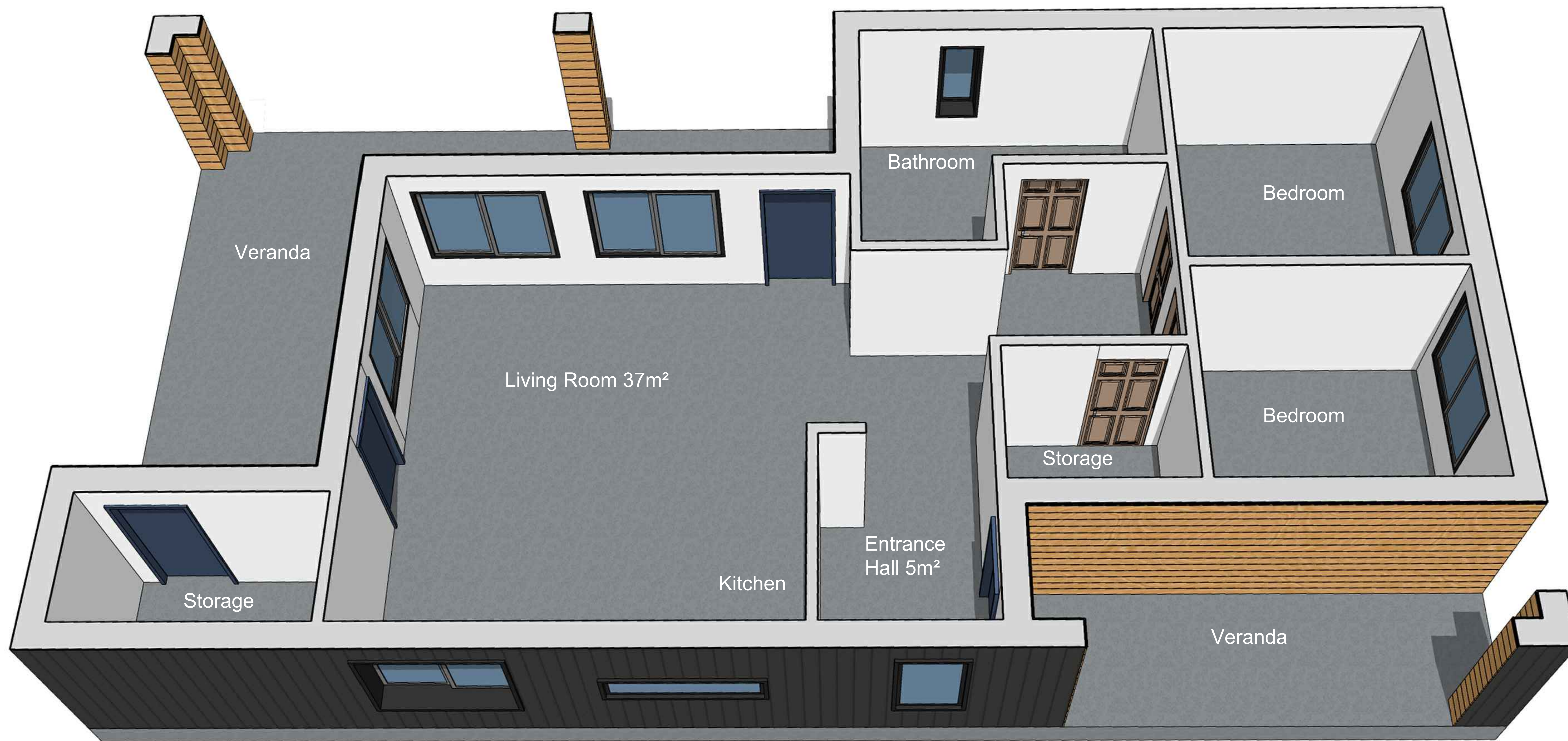
Plan Perspective Section