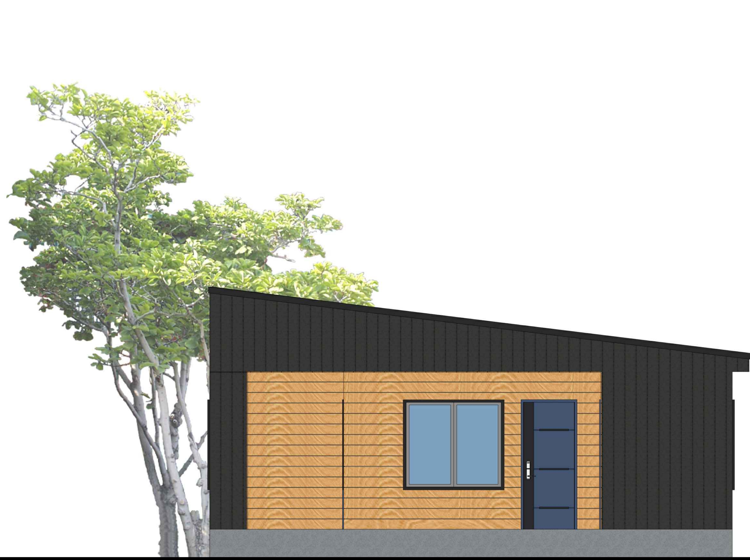
Left Side Elevation