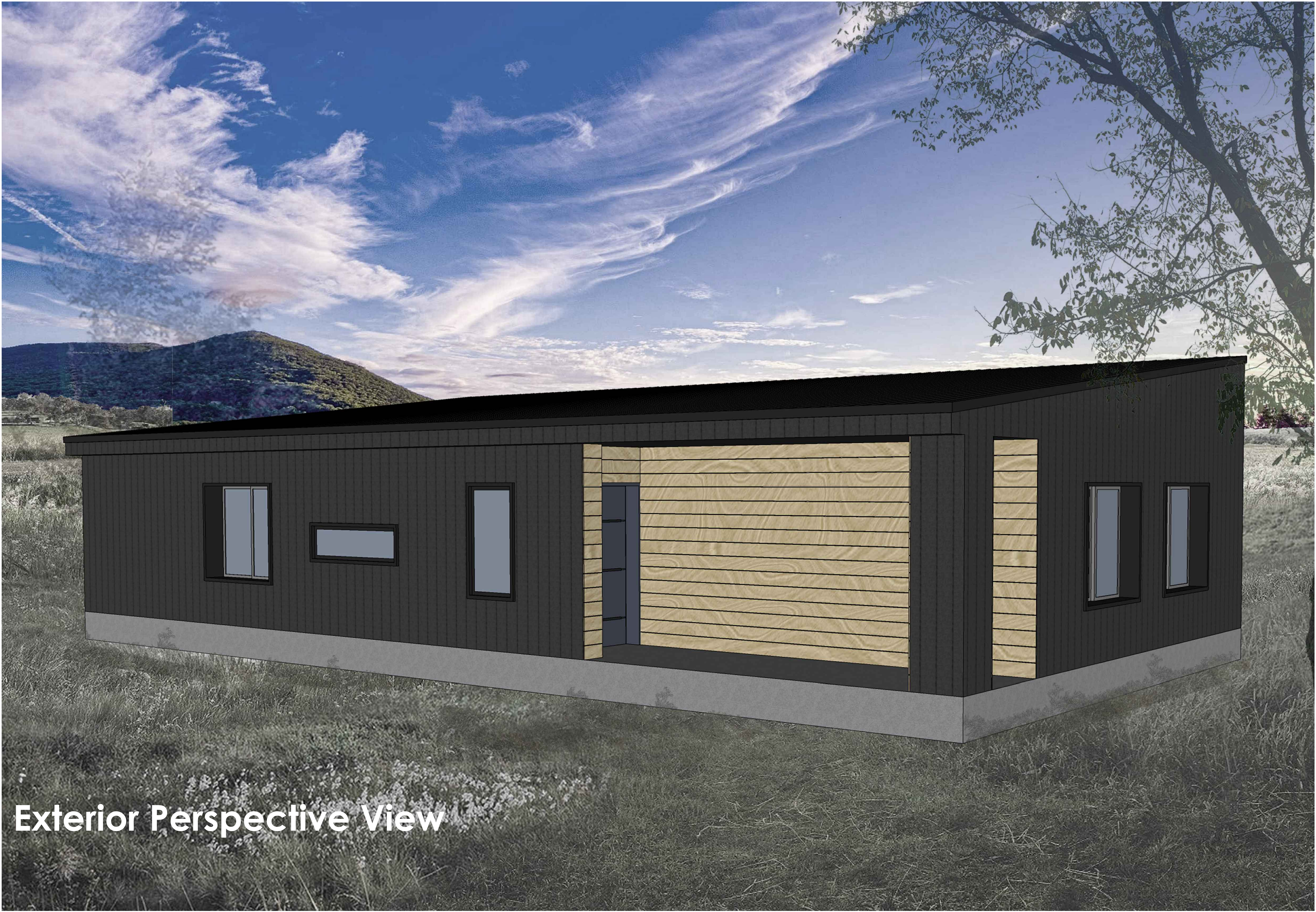
Exterior Perspective View