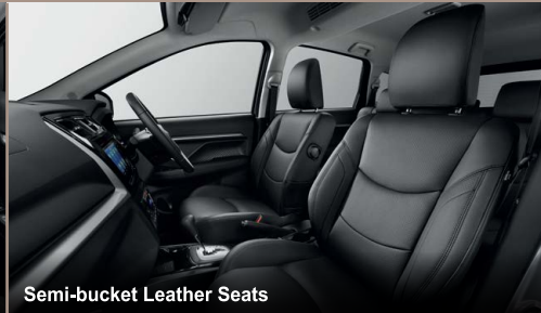
Semi-bucket Leather Seats