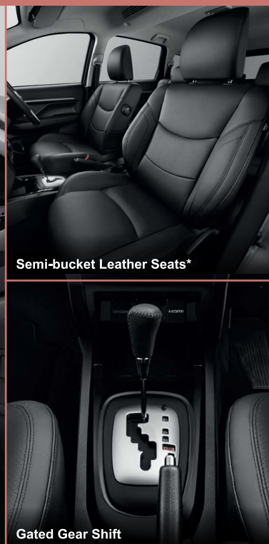
Semi-bucket Leather Seats*