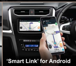
'Smart Link' for Android