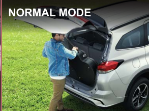
More room for more stuff.