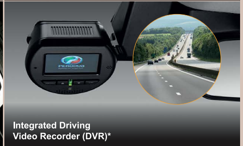
Integrated Driving Video Recorder (DVR)*