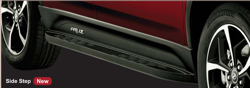
Side Step New