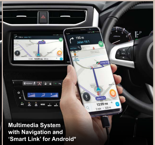
Multimedia System with Navigation and 'Smart Link' for Android*