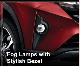
Fog Lamps with Stylish Bezel