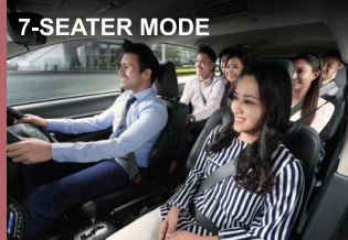
When you just need 2 more.