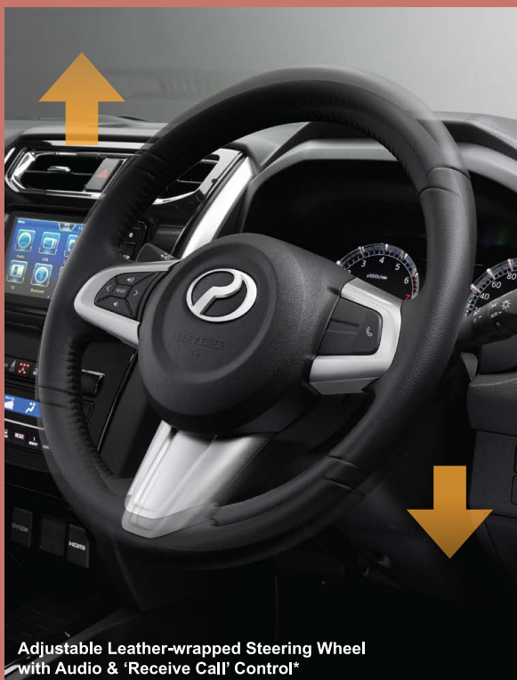
Adjustable Leather-wrapped Steering Wheel with Audio & 'Receive Call' Control*