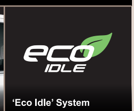
'Eco Idle' System