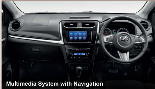
Multimedia System with Navigation