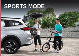
Pack it all in for weekend adventures.