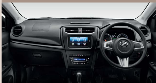
Digital Audio System with Bluetooth, USB & MP3