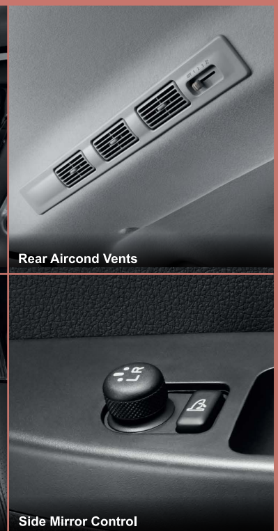
Rear Aircond Vents