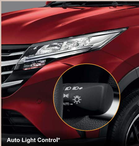
Auto Light Control*