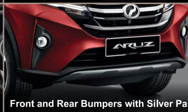
Front and Rear Bumpers with Silver Painted Diffuser