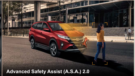
Advanced Safety Assist (A.S.A.) 2.0