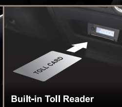
Built-in Toll Reader