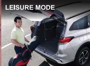
Load it up and pack it in.