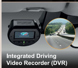
Integrated Driving Video Recorder (DVR)