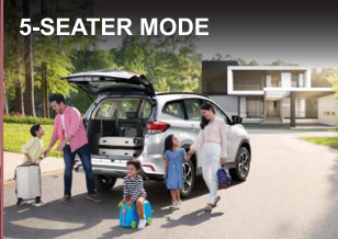
Road trips are always better with your loved ones.