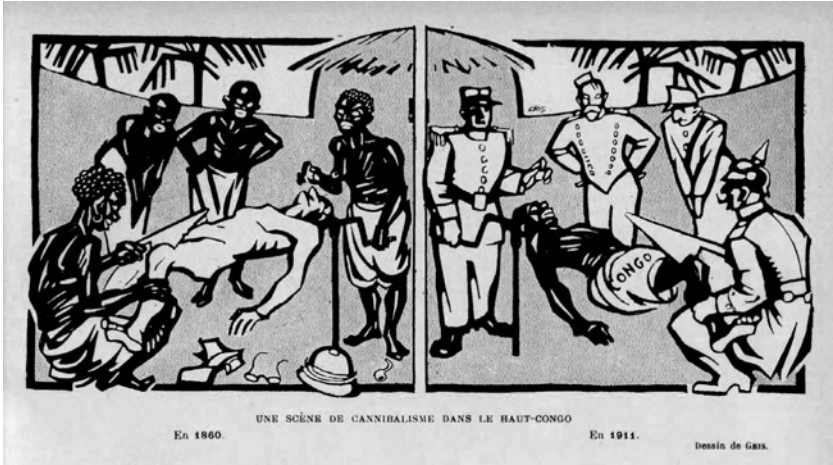
A cartoon published in the French journal, Le Rire , in 1911.