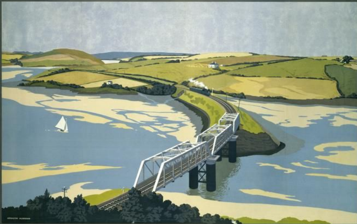
THE RIVER CAMEL NEAR PADSTOW

SEE THE WEST COUNTRY FROM THE TRAIN BY SOUTHERN RAILWAY