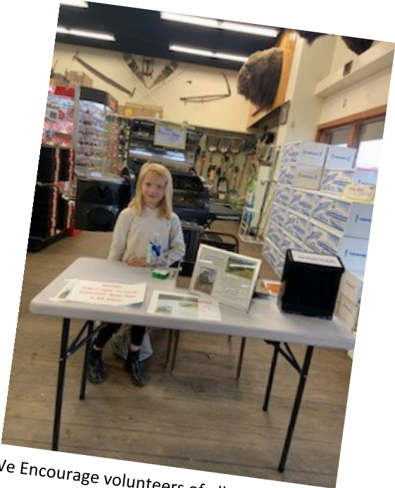
We Encourage volunteers of all ages