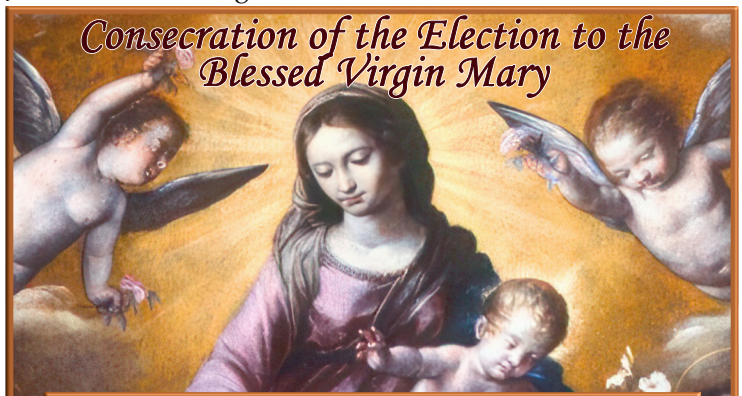
Consecration of the Election to the Blessed Virgin Mary