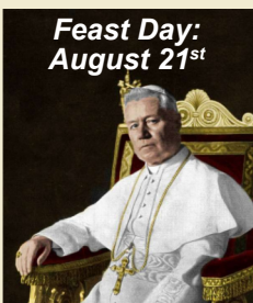
Feast Day: August 21 st