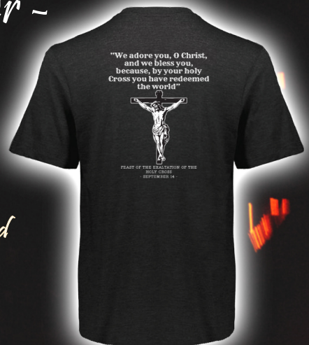
Sample Shirt (Please see website for actual available products)

HTTP://MCSPORTS.CHIPPLY.COM/HOLYCROSSFUNDRAISER2025