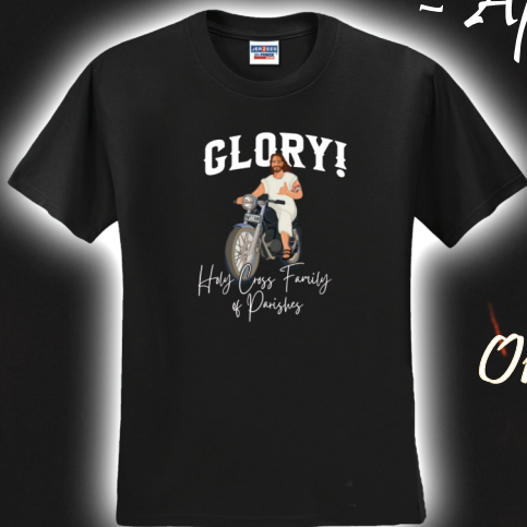
Sample Shirt (Please see website for actual available products)