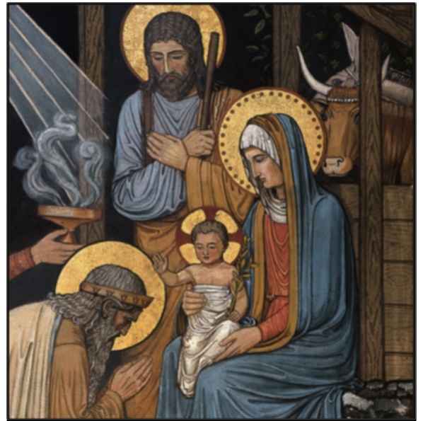
"The gift of Himself."