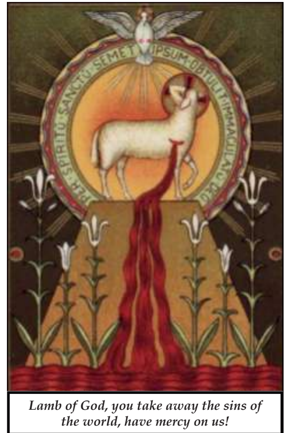
Lamb of God, you take away the sins of the world, have mercy on us!