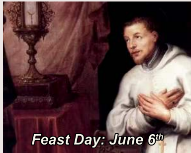
Feast Day: June 6 th

In the 12 th century in the French region of Premontre, Saint Norbert founded a religious Order known as the Praemonstratensians or the Norbertines. His founding of the Order was a monumental task: combating rampant