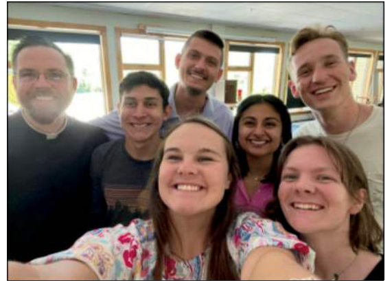
Me with the missionaries and student leaders... I think two summers ago...

To make this happen, priests from around the country will commit to being on site with the students. We work together to provide two opportunities per day for Mass, Adoration, and Confession (because some students work mornings and some work evenings). Throughout the day, the chaplains are available to the students for spiritual coaching where we walk them through the next steps of their spiritual journey, providing feedback and advice. That's where I come in. Usually, the days are long and packed, beginning early in the morning and lasting late into the night--it's an apostolate for college students after all! But every year, even though I return tired and worn out, wondering if I'm too old for this...it is an incredible opportunity that I am deeply grateful to be a part of.