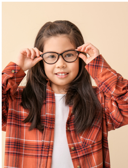
Glasses may be worn to improve vision.