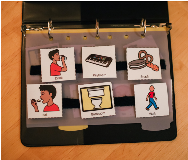
Some people communicate with pictures