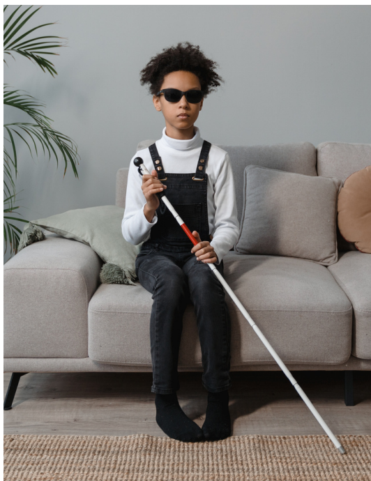
A white cane may be used by someone who is visually impaired to scan the area in front of them.