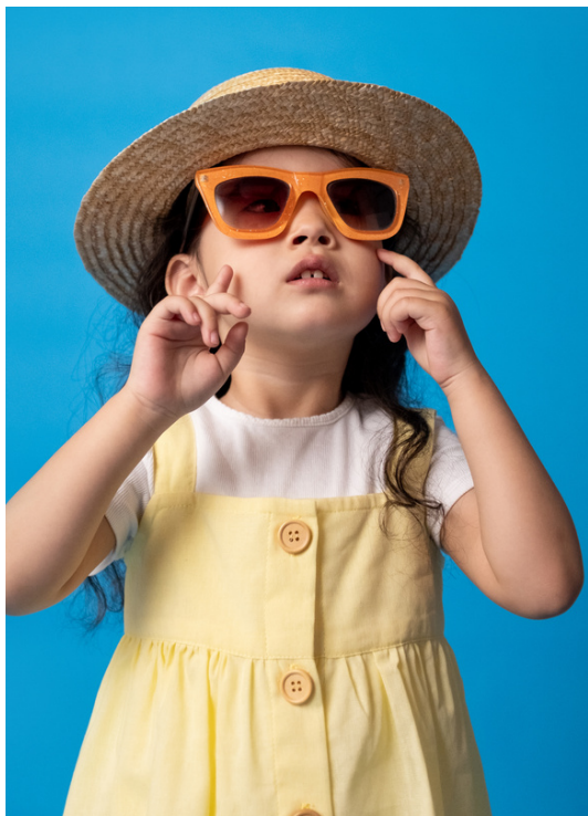
Some people are sensitive to light and may wear hats and sunglasses.