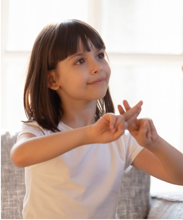
Some people use sign language or hand gestures