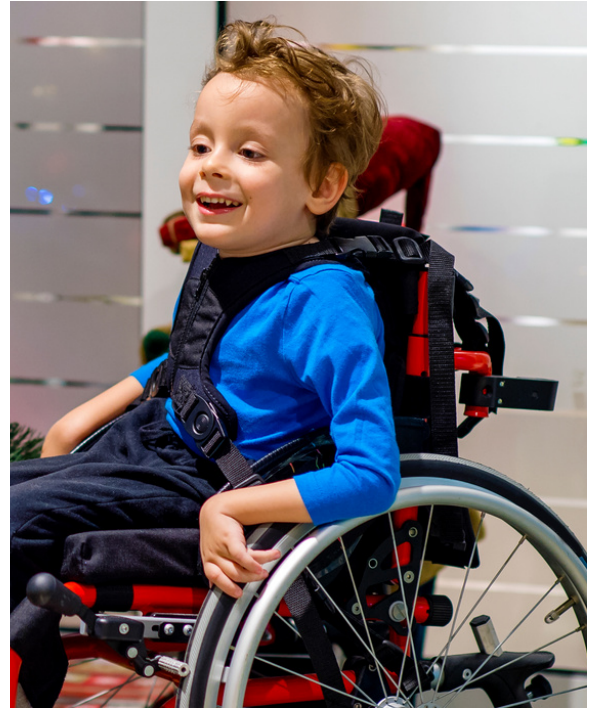
Some people use facial expressions or their voice