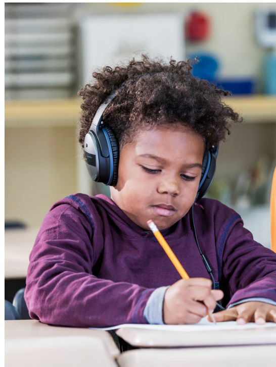
Assistive listening device/ headphones