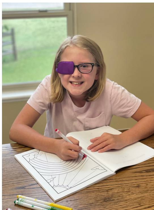
An eye patch may be used to help correct vision.