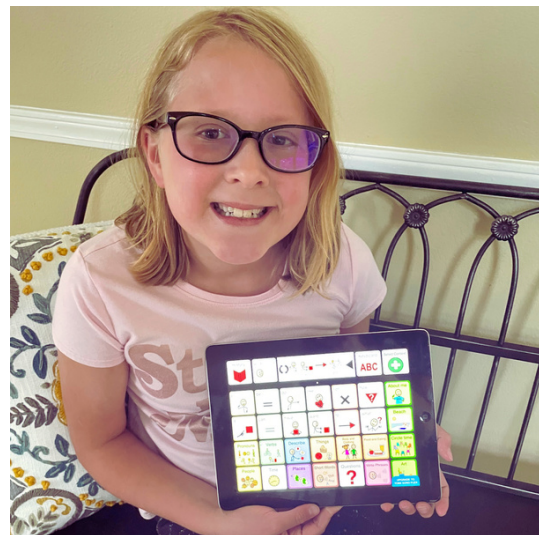
Some people use communication devices