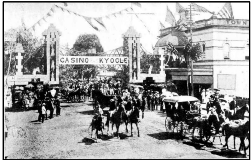
Opening Casino-Kyogle Railway 1909

The opening of the Casino-Kyogle Railway in 1909. The sod turning ceremony in connection with the Casino Kyogle railway line was a gay time for the far North Coast. Every part of the great Northern Rives District sent representatives. Kyogle was for the day practically deserted for so many residents journeyed over 20 miles to be present at the gathering.