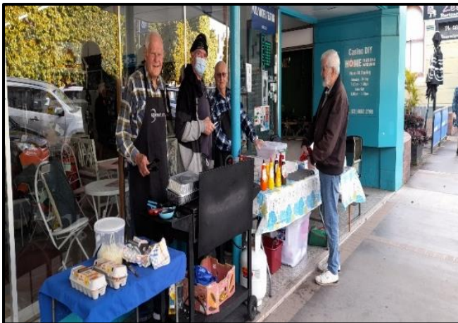
June DIY BBQ

OUR NEXT COLES BBQ ON SATURDAY 13 TH JULY AND 12 TH OCTOBER. TRUCK SHOW BBQ IS 3 RD AUGUST DIY BBQ 21 ST SEPTEMBER DIY BBQ 16 TH NOV