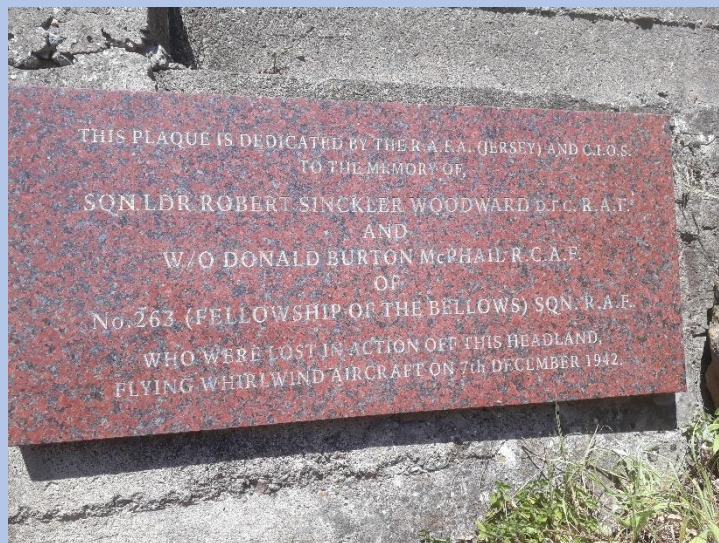
Plaque outside the bunker door.