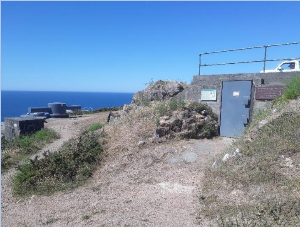
entrance to the museum where the plaque is situated.

We have tried on a number of occasions to contact local dive clubs to see if anyone has dived on these sites and what, if anything is left of the Whirlwinds. We know that the rear fuselage was constructed of magnesium panels which would have corroded away many years ago but there is still a lot we know nothing of regarding their construction, luckily, we have two Peregrine engines both at the Rolls Royce museum at Derby.