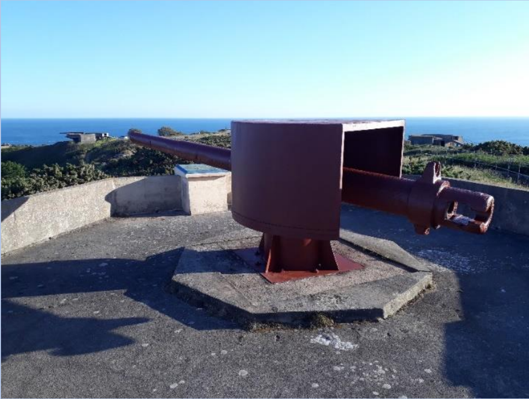
15cm gun under refurbishment