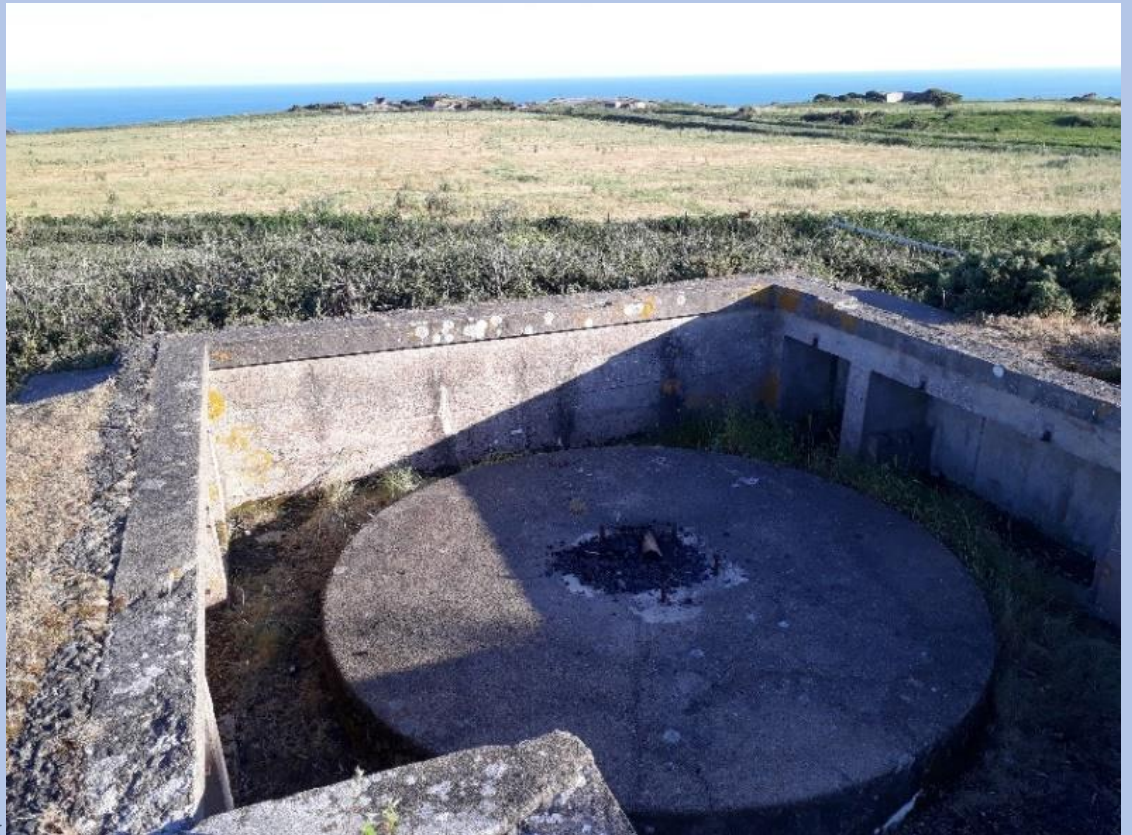
15cm gun emplacement