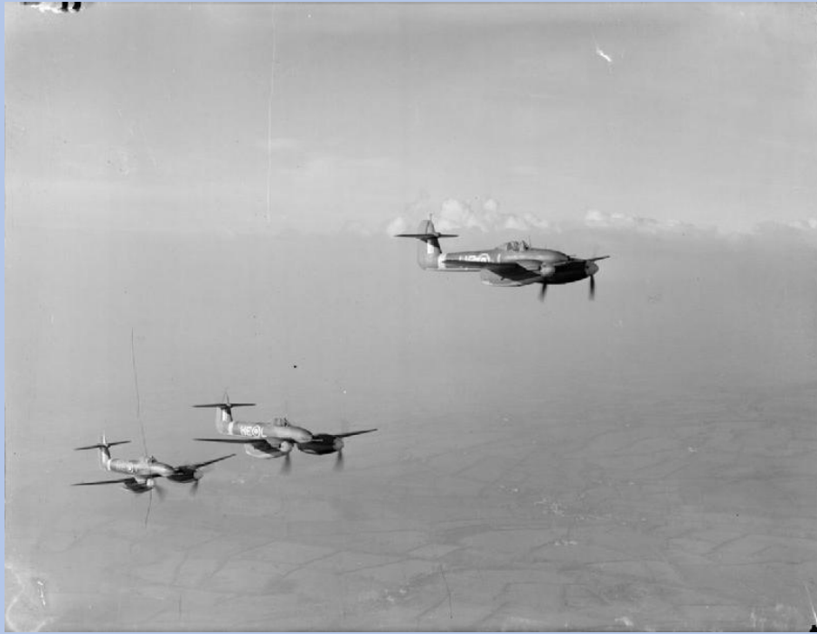
3 Whirlwinds of 263 Squadron over Exeter.

P6978 (HE-L) can be seen in the middle of this formation.