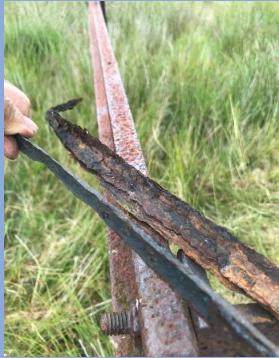
Longeron or stringer?