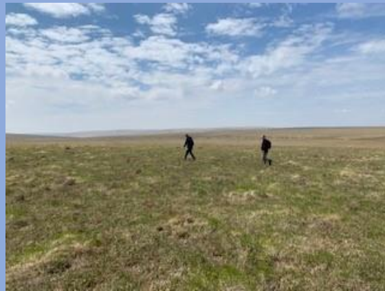
Here we go again