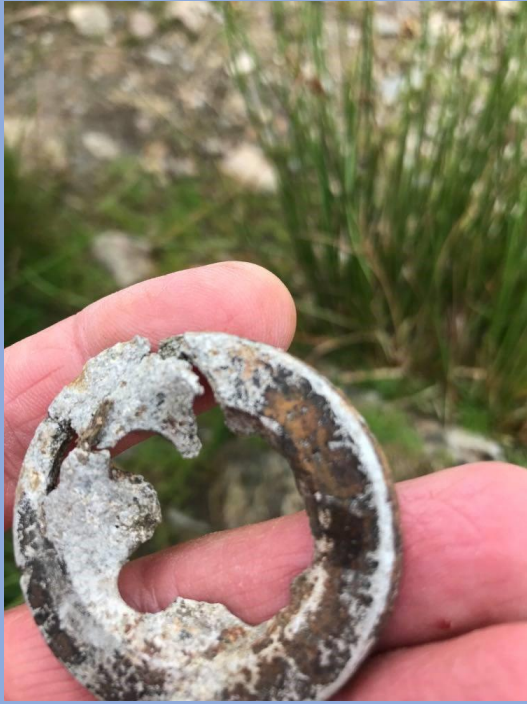
Alloy disc (black)