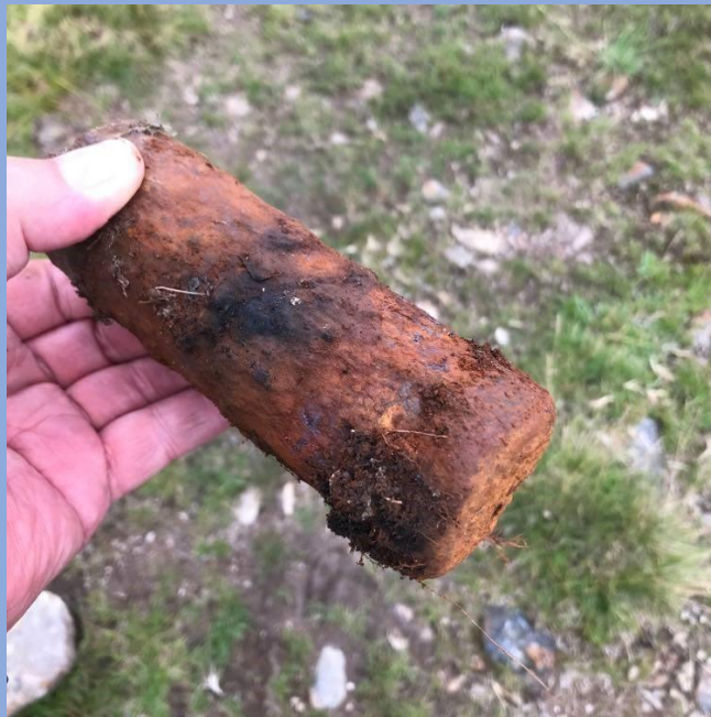
Pressure vessel or Water/Oil separator for a compressed air system?