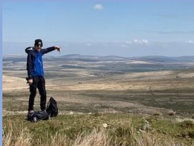
No! it's over here...