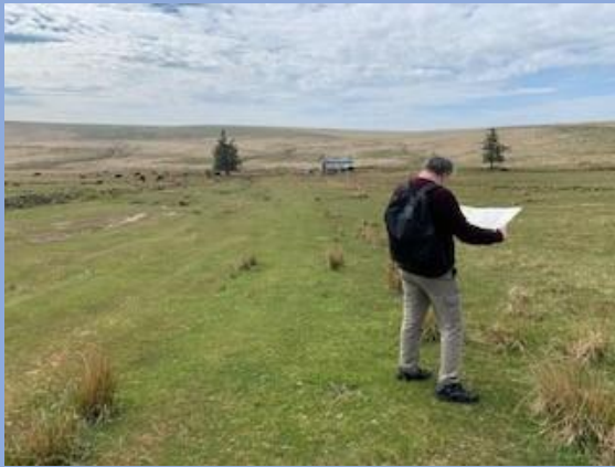
I think it's over here