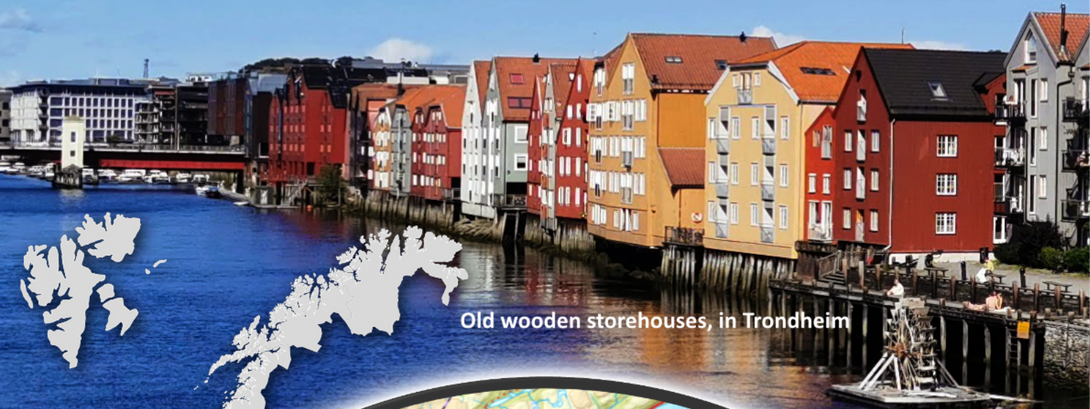
Old wooden storehouses, in Trondheim