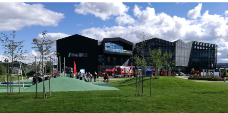
KIMEN, "The SEED" - Stjørdal cultural center

Acceptance: Applications will be considered in order of being received. Still the gender balance will be in focus