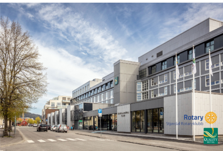
Quality Airport Hotel - Accommodation in Stjørdal