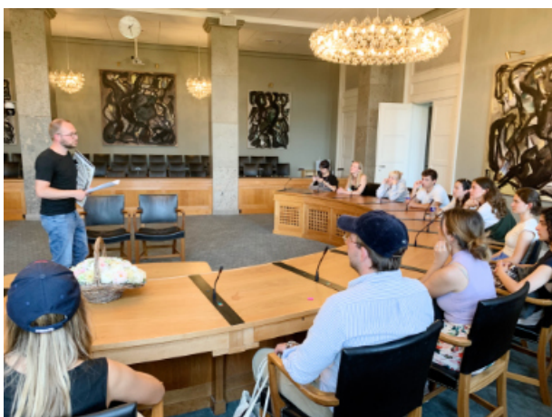
Camp Copenhagen 2025