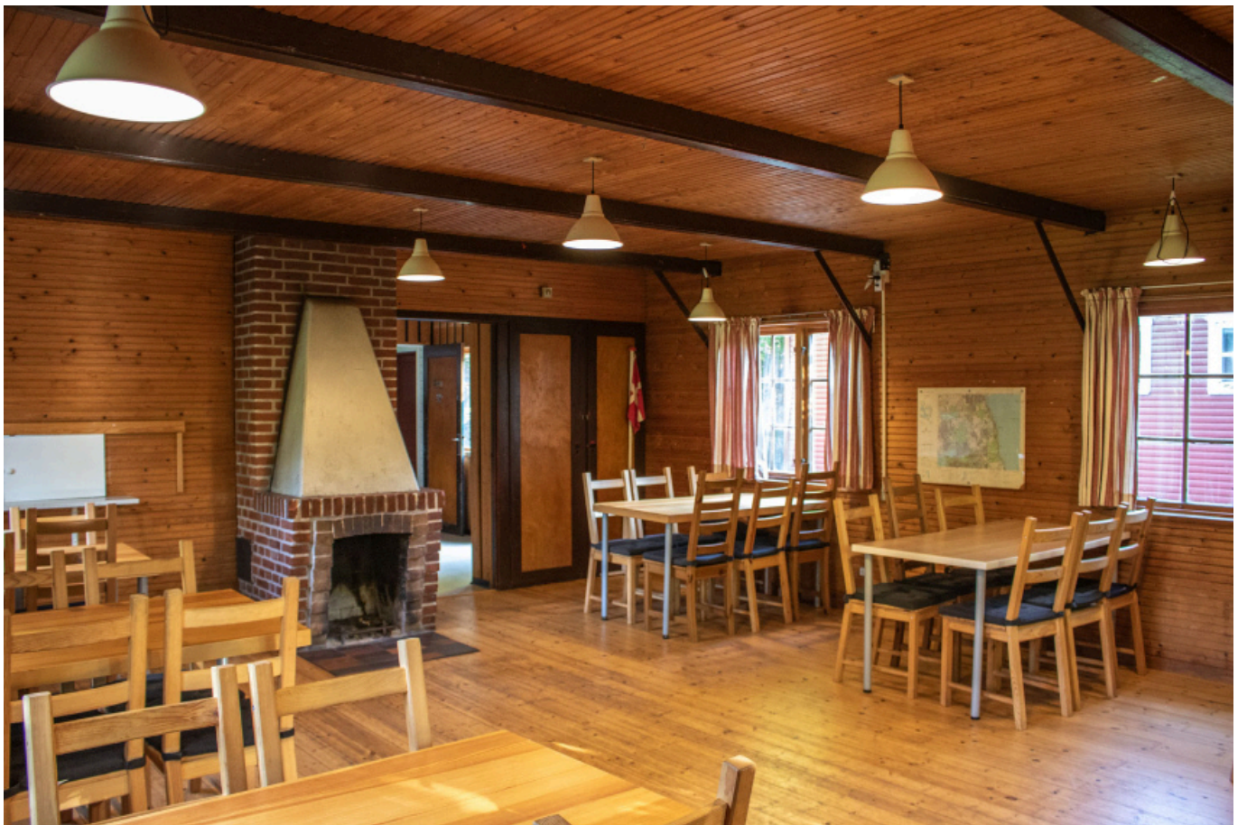
Hellerud scout cottage, Søterrassen 17, 2840 Holte, Denmark