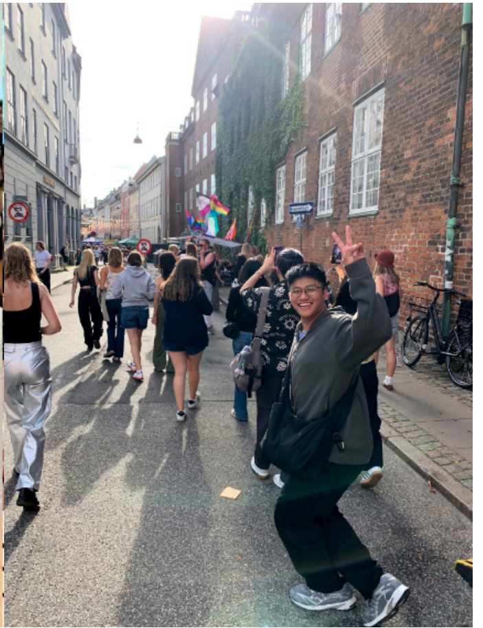
Camp Copenhagen 2025