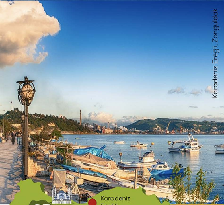
Karadeniz Ereğli, Zonguldak