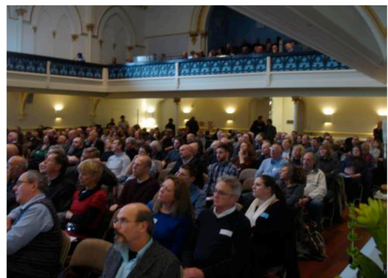
This Declaration by the British Constitution Group to Restore the Rule of Law in the United Kingdom was witnessed and unanimously endorsed by around five hundred people at the Guildhall, Winchester, on the 19th of November, 2016.