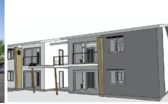
Hunt Capital Partners Preserves Denver Affordable Housing Development for Seniors with Disabilities