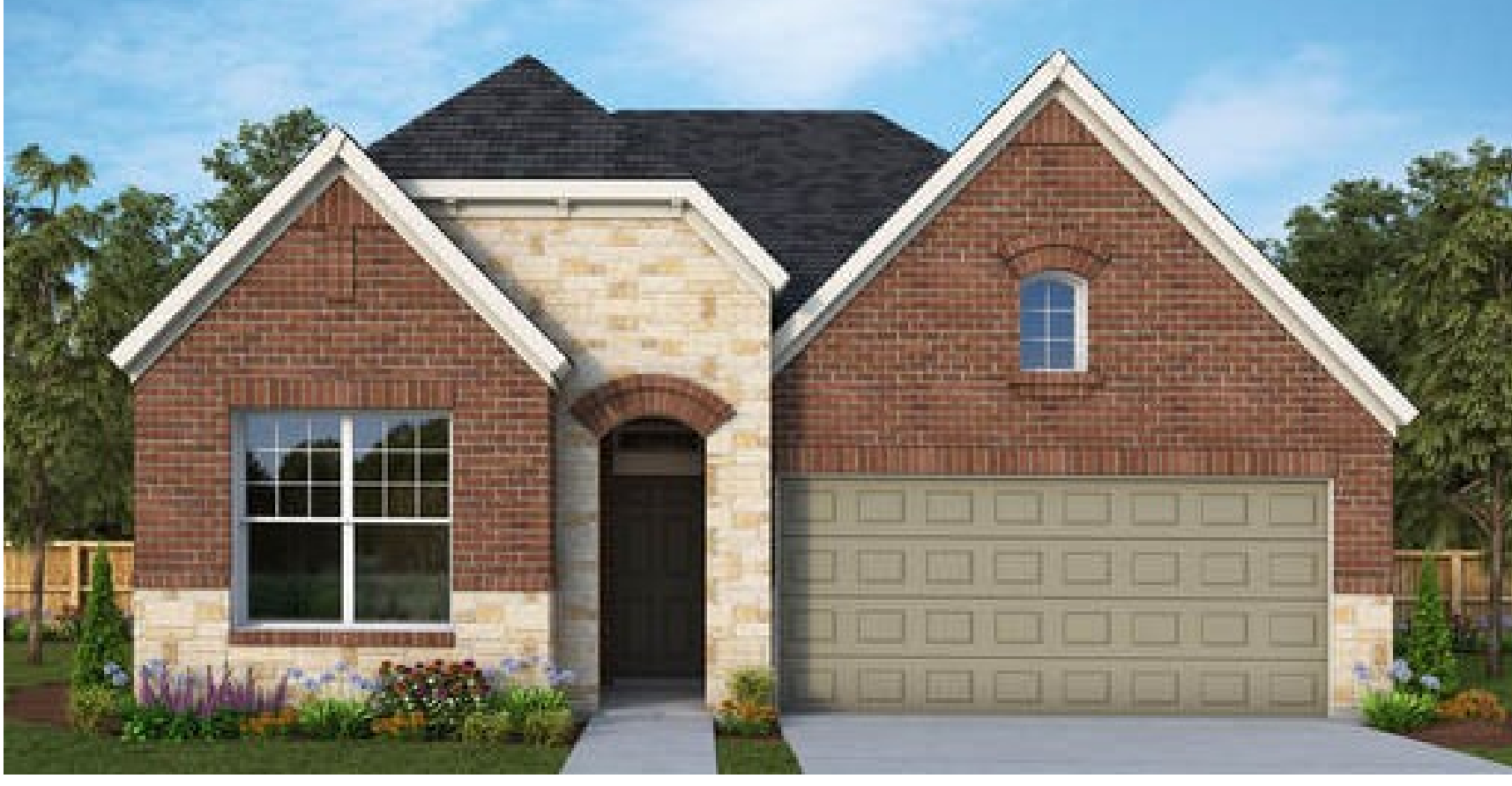
Hunt Communities partners up with David Weekley Homes and HomeAid Austin