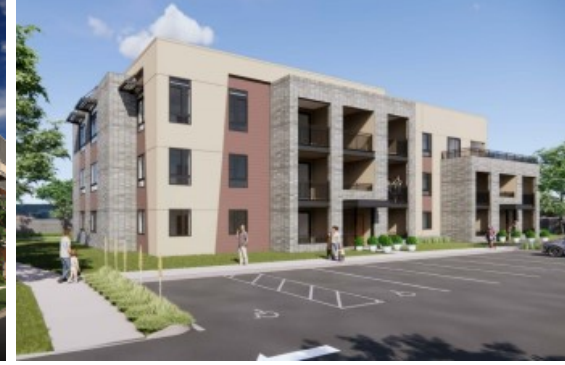
Hunt Capital Partners Syndicates FCAA Disaster Relief LIHTC Credits For Napa County Development Following Wildfires