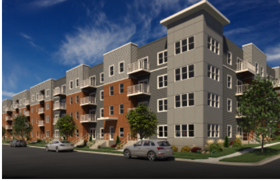
Solid Rock Christian Center Uses Land to Build Affordable Housing Apartments Financed by Hunt Capital Partners