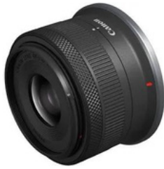
Canon RF-S 18-45mm F4.5-6.3 IS STM Lens R180 a day