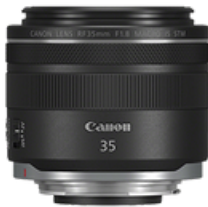
CANON RF 35MM F1.8 MACRO IS STM R250 a day