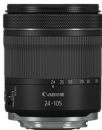
CANON RF 24-105 F4 MACRO IS STM R300 a day