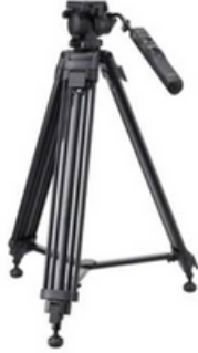
Gear Cam 1.8 professional video tripod + bag R380.00 a day