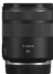
CANON RF 85MM F2 MACRO IS STM R300 a day