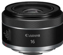
CANON RF 16MM F1.8 MACRO IS STM R200 a day